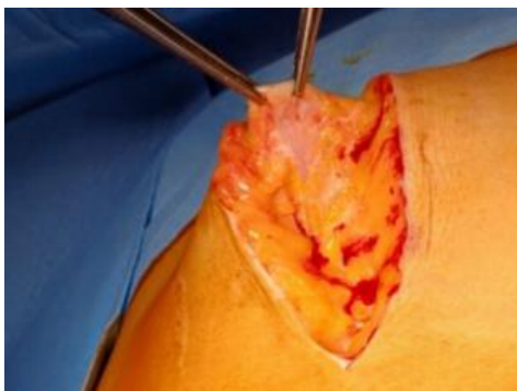
Figure 2: Highlighting, opening and dissection of the eventration sac

Next, figures 2-7 show the different stages of the open operation to solve the recurrence of eventration by using the existing mesh.