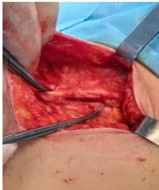
Figure 5: Intraoperative verification of the tension created by approaching the edges of the defect, on the smallest diameter.