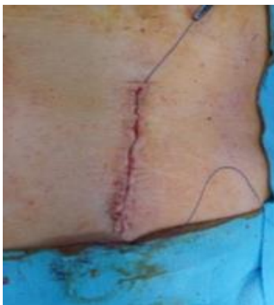
Figure 7: Integumentary suture with intradermal thread.

Before deciding to use the existing prosthesis, it was verified, as shown in Fig. 5, whether tension was created by closing the defect on the smallest dimension. The patient had a good recovery, being discharged 22 hours after the intervention. Postoperative monitoring for 6 months recorded the disappearance of pain and swelling.