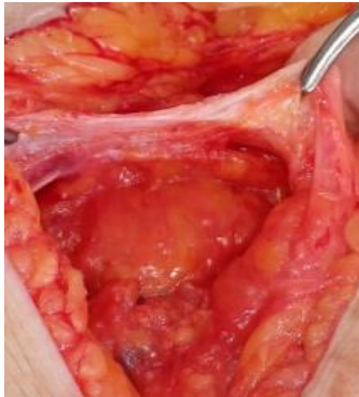
Figure 4: Preparation of defect edges.