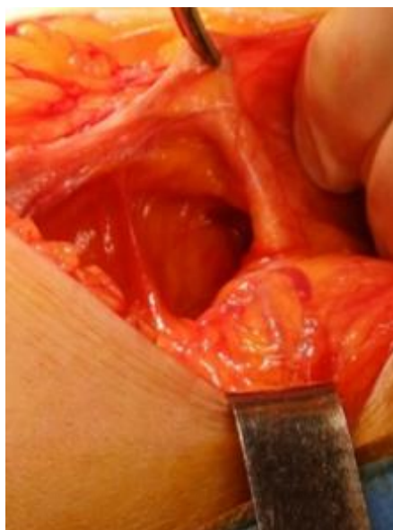
Fig. 3: The parietal defect formed in the area of the well-integrated mesh, with a maximum diameter of about 7 cm.