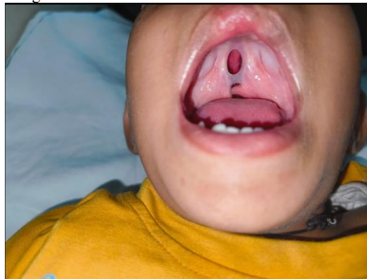
Figure 1: Preoperative photograph of the oral cavity confirms the diagnosis of a complete cleft palate defect.

as for publication. He was posted for the cleft palate repair under the smile train scheme; the world's largest cleft-focused organization, that provides 100%-free cleft surgery and other comprehensive cleft care to children globally.