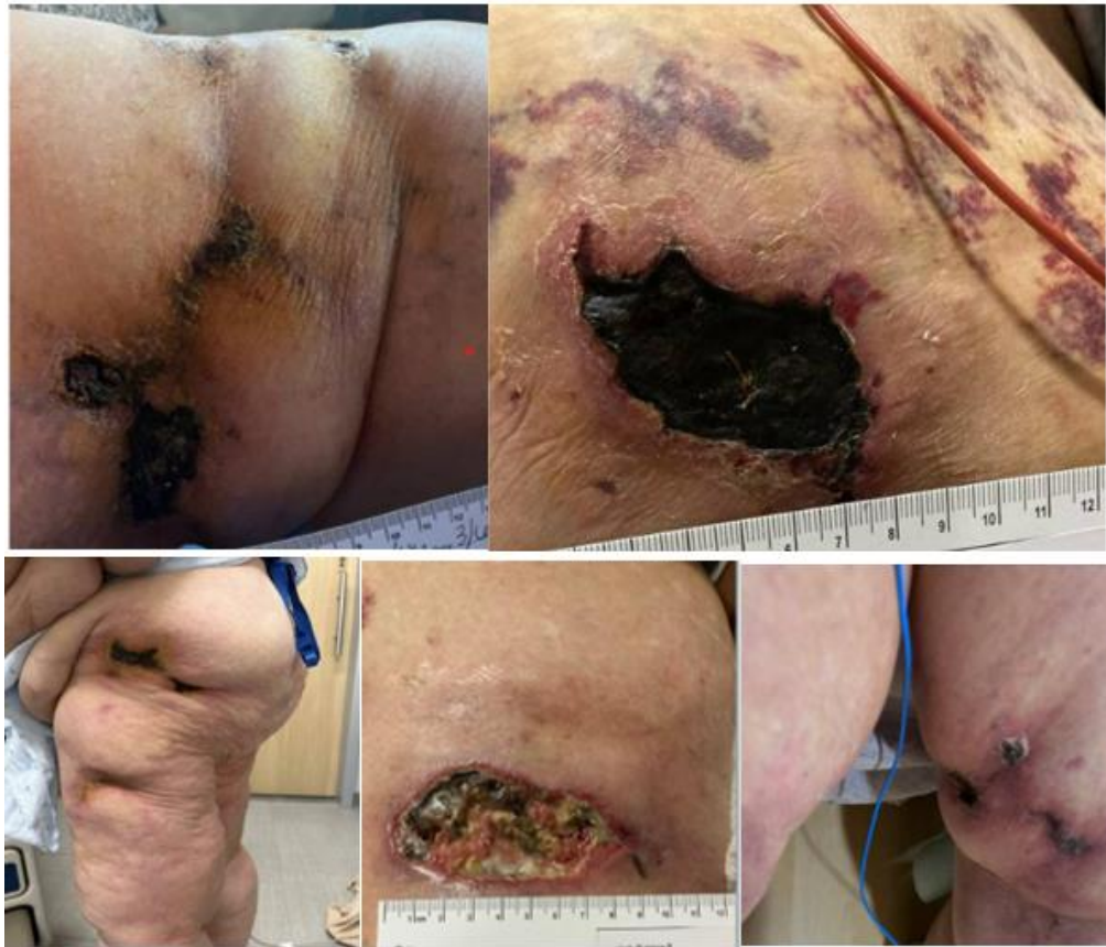
Figure 1: clockwise lesion seen on the left flank, anterior abdominal wall, left thigh, and right thigh. Left flank.

These skin lesions initially presented with induration on her flanks and anterior abdominal wall. Subsequently, they progressed to hyperpigmentation of the skin and then evidence of necrosis associated with pain and tenderness to palpation. Once the skin lesions were associated with