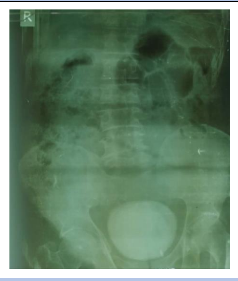
Figure 2: A KUB demonstrates degenerative changes involving the lumbar spine, iliac and pubic bones with both hip joints. The previously describe oval opacity of calcific density is also demonstrated occupying the pelvic cavity.

Case 2: this is a sixty-five-year-old retired civil servant who presented from a peripheral facility for a plain abdominal radiograph (KUB view) on account of recurrent lower urinary tract symptom (LUTS). Some of these are incomplete bladder emptying, irritation along the penile and supra-pubic