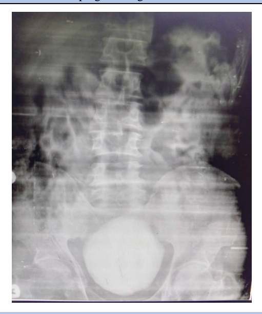
Figure 2: A KUB demonstrates degenerative changes involving the lumbar spine, iliac and pubic bones with both hip joints. The previously describe oval opacity of calcific density is also demonstrated occupying the pelvic cavity.