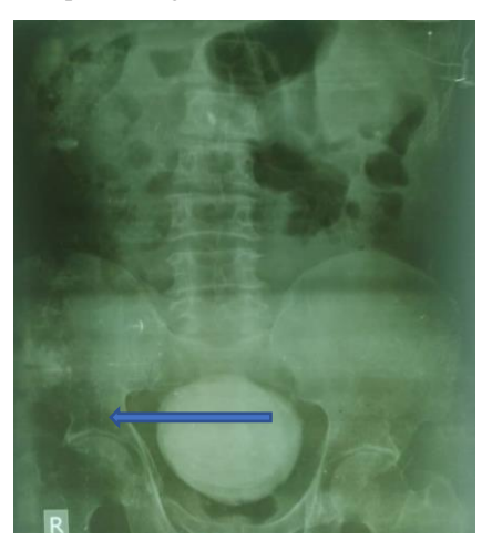
Figure 1: A KUB; demonstrates a huge, oval opacity of calcific density within the pelvic cavity measuring about 90mm x 90mm in dimension in keeping with a giant intravesical calculus (Left blue arrow).

lower urinary tract symptom (LUTS). Some of these are incomplete bladder emptying, irritation along the penile and supra-pubic region with poor and splitted urinary stream. The patient is conscious and oriented, with no sign of palor, cyanosis or dehydration. The KUB demonstrated an oval opacity of calcific density occupying most part of the pelvic cavity; this measured about 90mm x 90mm in dimension (Figures 1 and 2). A complementary abdominal and pelvic ultrasonography demonstrated a curvilinear echogenicity casting marked posterior acoustic shadow with associated bladder wall thickening and moderate hydroureteronephrosis bilaterally. Prostatic enlargement of about 58millilitre was also demonstrated most likely from benign prostatic hyperplasia (BPH). A diagnosis of a giant vesical calculus in a patient with features of BPH and bladder outlet obstruction was made. The patient was advised to go for further clinical evaluation and assessment with possible intervention by an expert urologist.