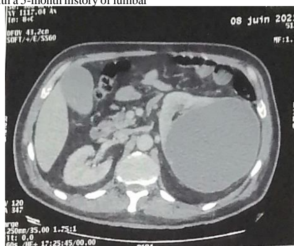
Figure 1: Coronal section from an abdominal CT scan in the arterial phase showing a 17 cm renal cyst with contrast-enhancing wall and hypodense content.

Despite 48 hours of antibiotic treatment, there was no clinical or biological improvement. A contrast-enhanced abdominal and pelvic CT scan (excretory phase) confirmed the findings without providing further diagnostic clarity (Figures 1 and 2).