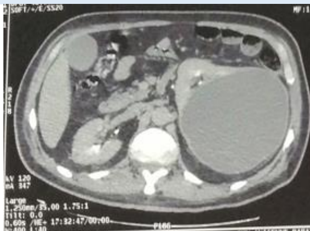
Figure 2: Coronal section from a delayed-phase abdominal CT scan showing a 17 cm renal cyst with contrast-enhancing wall and hypodense content. No communication was observed between the cyst and the pelvicalyceal system.

Ultrasound performed by the on-call urologist prior to nephrostomy drainage, revealing an anechoic cavity developed within the renal parenchyma.