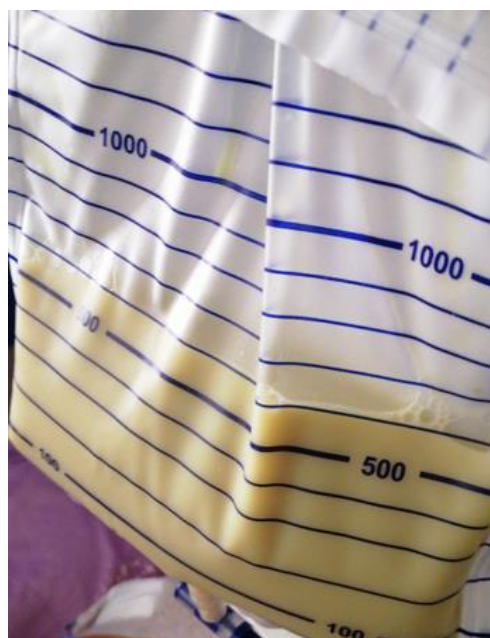
Figure 4 : Drainage fluid composed of approximately 600 cc of purulent material.