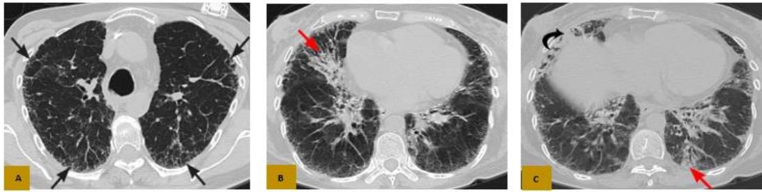
Figure 3: Axial CT in parenchymal window (A, B and C), shows thickening of the interlobular and intralobular interstitium at the subpleural level (black arrows in A) with some areas of incipient consolidations (red arrows in B and C) as well as honeycombing (black arrow in C), in relation to chronic diffuse interstitial lung disease.

At the end of September 2023, a multidisciplinary medical board meeting was held, which determined that the patient had grade 2 pneumonitis associated with trastuzumab, so she would continue treatment with prednisone 1 mg/kg/day for six weeks, and then restart treatment with trastuzumab. After three weeks of treatment with corticosteroids, she was admitted to the emergency room due to severe dyspnea, productive cough with greenish expectoration, oxygen saturation of 77%, and tachycardia. Auxiliary tests were requested, which showed leukocytosis without left shift and a C-reactive protein value of 132. A chest TEM without contrast was performed on 10/19/23 (Figure 4) which showed a marked subpleural interstitial thickening in both lung fields, with multiple bronchiectasis