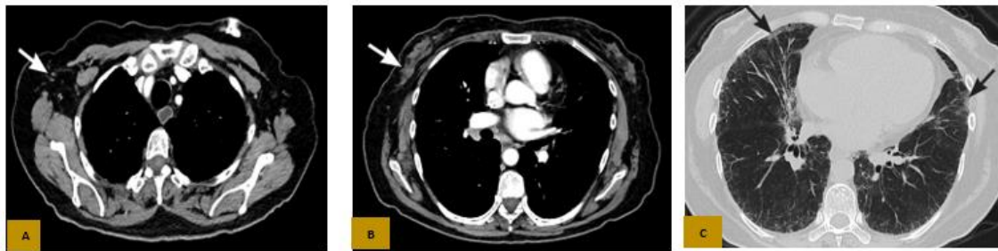
Figure 2: Axial CT with contrast in the mediastinal window (A and B) shows complete imaging response in the chest wall (white arrow in B), no axillary or mediastinal lymphadenopathy (white arrow in A), and the parenchymal window (C) shows incipient signs of Non-Specific Interstitial Lung Disease (NSILD) predominantly in the middle lobe and left lower lobe (black arrows).