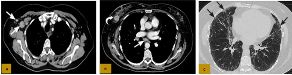
Figure 1. Axial CT with contrast in the mediastinal window (A and B) shows a tumor in the right breast with axillary and subcarinal lymphadenopathy (white arrows in A and B); and the parenchymal window (C) showed nonspecific diffuse subpleural parenchymal reticulations (black arrows).

response. Five courses of trastuzumab were administered from 05/25/2023 to 08/17/2023 and external radiotherapy to the residual breast from 06/19/23 to 07/24/23.