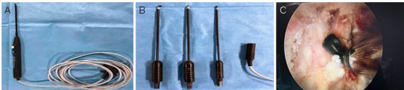
Figure 4: A: monopolar device; B: bipolar devices; C: intraoperative image with bipolar cautery.

As a possibility, available in other centers, the radiofrequency system is also frequently used for control the hemorrhage during the surgery. The use of bone wax its also a possibility for specific situations. The coagulation devices used during UBE (Figure 4).