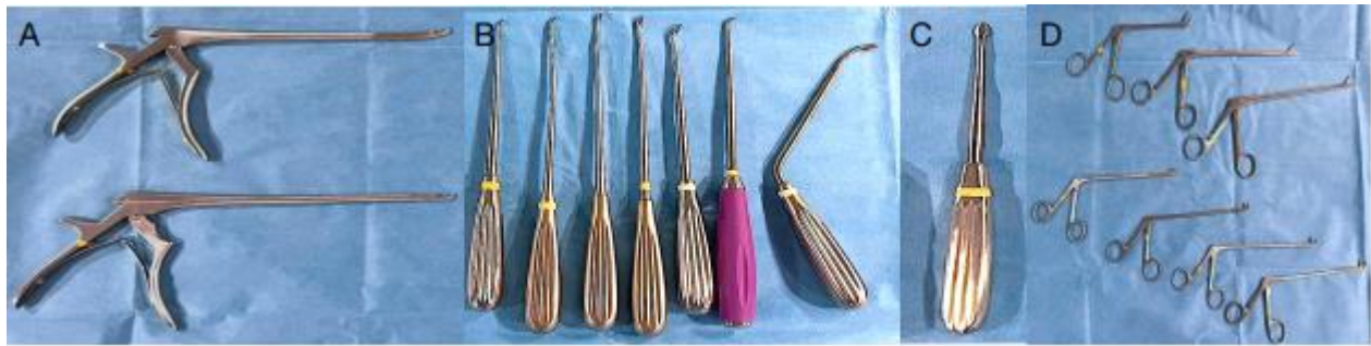
Figure 5 : A: Kerrison punch ; B: curets; C: Indian knife, D: Pituitary rongeurs.

Actually we have also available many specially designed UBE toolset, which is comprised common tools and also devices for establishing the standard UBE surgical pathway and performing all surgical steps. Particular instruments as rotating Kerrison punch, curved Kerrison punch, curved Curets and the Indian knife all of them are essential for do UBE surgery (Figure 5).