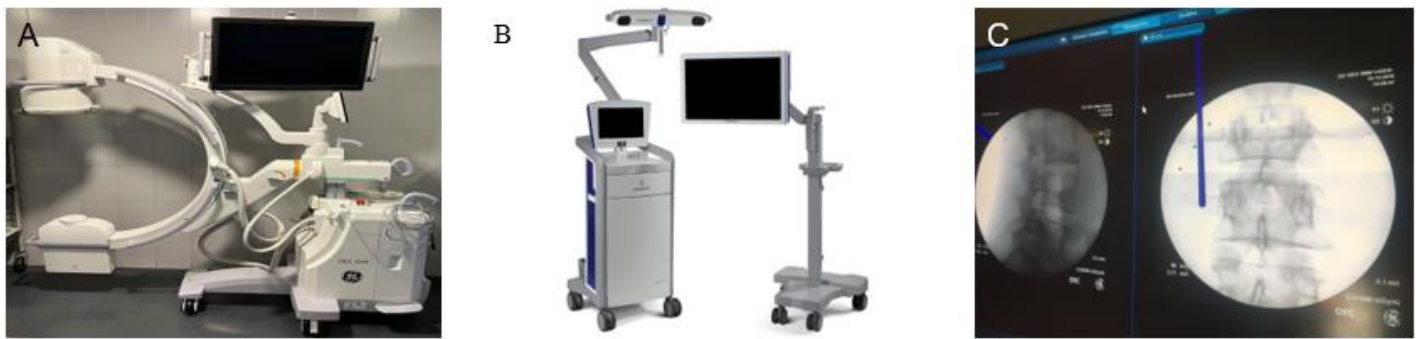
Figure 3: A: c-arm device; B: neuronavigation system; C: intraoperative image with fusion or radiography and neuronavigation.

In UBE surgery we use two different types of coagulation systems monopolar and bipolar. The monopolar coagulation is used in all the procedures except in patient with a pacemaker.