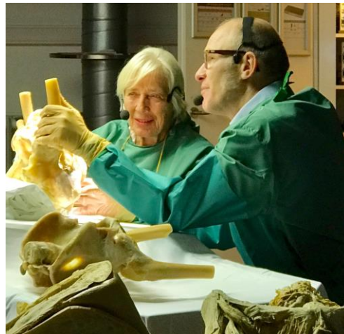
Figure 1: Clinical anatomy of the minor pelvis.

Only with good knowledge of “clinical anatomy” endoscopic surgical procedures (Figure 1) can be understood. The training of laparoscopic surgery on body donors definitely enriches all learning efforts (Figures 2 and 3). When teaching on body donors there is no time pressure, which - of course - at life surgical demonstrations has to be discussed. Figure 4 shows the final surgical situation after SLH (Subtotal Laparoscopic Hysterectomy) performed in a body donor compared to a patient.