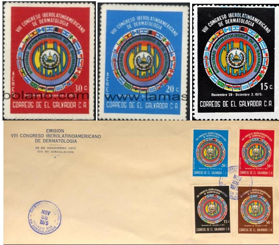
Figure 9. A selection of philatelic materials from El Salvador dedicated to the 8th Congress of Dermatologists of Latin American Countries

The following figure 10 shows a collection of philatelic materials from a number of countries (postage stamps and artistic stamped envelopes) dedicated to previously held Congresses on Dermatology [25]. This is a postage stamp and envelope from the Dominican Republic (1999),