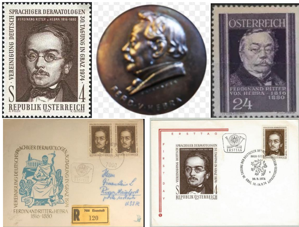
Figure 1. A collection of materials dedicated to the Austrian dermatologist, Ferdinand Ritter von Hebra

Further, in Figure 2, postage stamps and a commemorative coin of Turkey, with a face value of 1000 Turkish lira (1996), are presented, dedicated to the famous Turkish/Arab doctor and scientist, dermatologist and venereologist, whose life and scientific work were dedicated to the