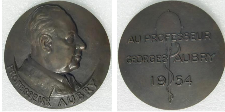
Figure 11E. Commemorative, bronze tabletop medal-plaque (1907), dedicated to PROFESSEUR JACQUES Charpy

Figure 11 E shows, in obverse and reverse, a tabletop, bronze, commemorative medal (1954), dedicated to PROFESSEUR JACQUES CHARPY [32].