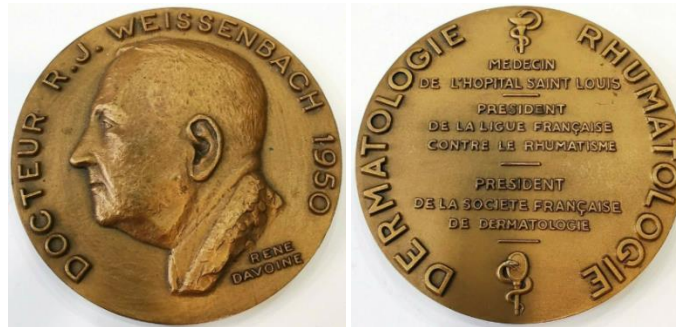
Figure 11B. Commemorative table bronze medal dedicated to the dermatologist Dr. Weissenbach

Further, in Figure 11 B, the obverse and reverse of the commemorative bronze medal (1950) dedicated to Dr. Weissenbach – dermatologie and rhumatologie is presented [28].