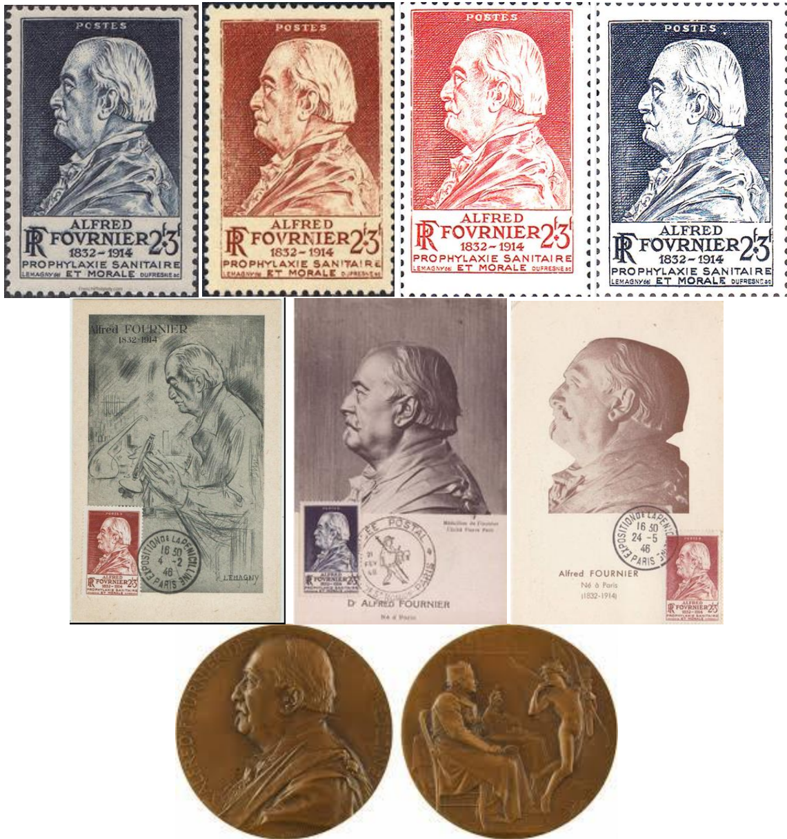
Figure 3. A selection of French collection materials dedicated to the famous French doctor and venereologist, Alfred Fournier

Figure 4 shows a postage stamp with an image of a famous Spanish dermatovenerologist, Juan Azua Suárez (1859-1922) [12].