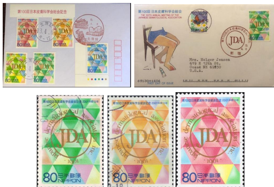
Figure 7. Philatelic materials of Japan dedicated to the Japanese Dermatological Association

Figure 7 shows a selection of Japanese philatelic materials (postage stamps (2001) and artistic stamped covers and first day covers (2001, 2003) dedicated to the Japanese Society of Dermatovenerologists [14].