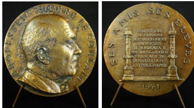
Figure 11C. Commemorative table bronze medal dedicated to the dermatologist and syphilologist Pierre Le Coulant Bordeaux

Figure 11 C shows a bronze commemorative table medal dedicated to the French doctor Pierre Le Coulant Bordeaux, a dermatologist and syphilologist [29].