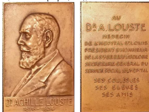
Figure 11D. Commemorative bronze tabletop plaque (1907) dedicated to Docteur Achille Louste

Next, in Figure 11 D, is a rectangular, commemorative, bronze table plaque (1907), dedicated to Docteur Achille Louste (1876-1934) [31].