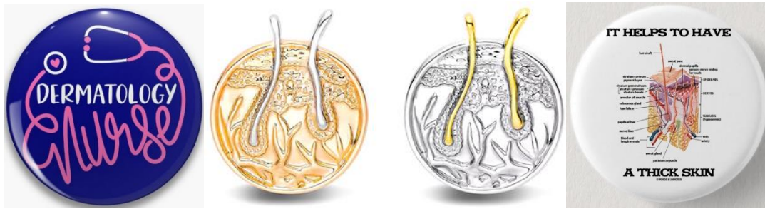
Figure 12. Thematic badges on dermatology and the Medal named after A. M. Arieievich and Z. G. Stepanishcheva LAUREATE "For merits in medical mycology Dermatology"

This concludes another thematic authorial research article dedicated to dermatology, venereology and its heroes – practical doctors and scientists who worked in the field of this important medical, clinical discipline. The author plans new research in this area of medicine, reflecting a number of collection tools, which will be published in the near future.