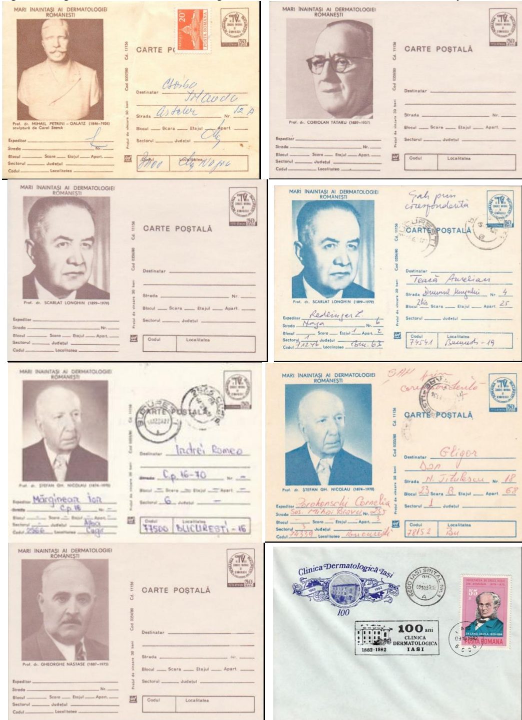
Figure 5. Philatelic collection of Romania, thematically dedicated to Romanian dermatovenerology and its heroes

postcards of Romania are presented, with the presentation on them of a group of famous dermatovenerologists, both scientists and practicing doctors, as well as the building of the dermatovenerology clinic in Bucharest, in honor of its 100th anniversary [13].