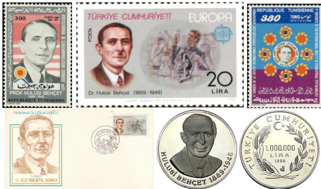
Figure 2. Collection materials dedicated to the famous Turkish dermatovenerologist, professor Hulusi Behcet, Türkiye

first 2 articles already mentioned by the author. We are talking about a practicing dermatovenereologist, and a famous Turkish/Arab scientist in this field of medicine, Professor Hulusi Behcet (1889-1948), Turkish [1, 2, 7-9, 35].