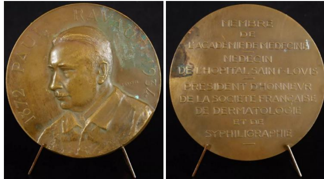
Figure 11A. Commemorative table bronze medal dedicated to the doctor dermatologist and syphilologist Paul Ravault

Further, in Figure 11 B, the obverse and reverse of the commemorative bronze medal (1950) dedicated to Dr. Weissenbach – dermatologie and rhumatologie is presented [28].