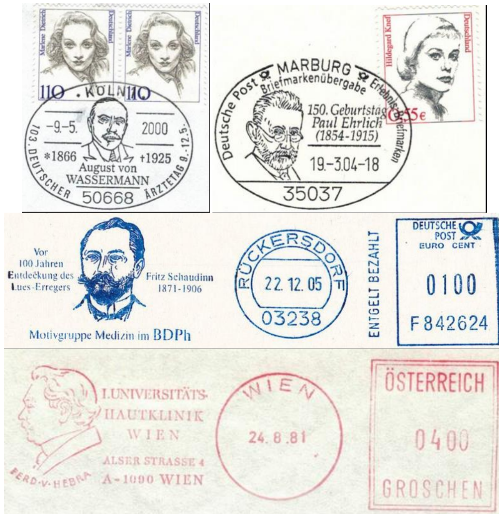
Figure 6: A selection of special cancellation postmarks dedicated to a number of dermatologists and venereologists who dealt with the problems of diagnosing and treating syphilis

Figure 7 shows a selection of Japanese philatelic materials (postage stamps (2001) and artistic stamped covers and first day covers (2001, 2003) dedicated to the Japanese Society of Dermatovenerologists [14].