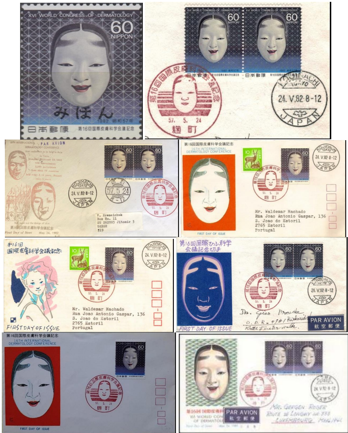
Figure 8. Philatelic materials of Japan dedicated to dermatology and cosmetology