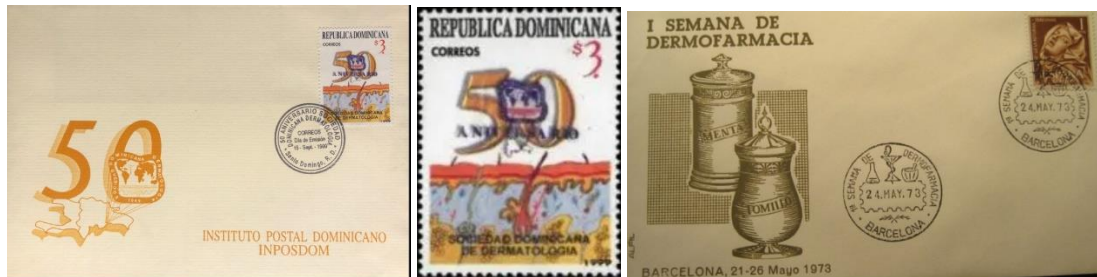
Figure 10. Philatelic materials dedicated to dermatology

dedicated to the International Congress on Dermatology held in this country. Also, in this same figure, an artistic stamped envelope from Spain (1973), dedicated to dermatological pharmacy [26].