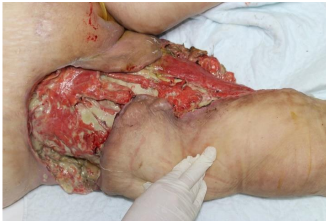
Figure 4: two weeks after admission.

Every day it was carried debridement until the gradual achievement of the fascia (two weeks after admission) (figure.4).