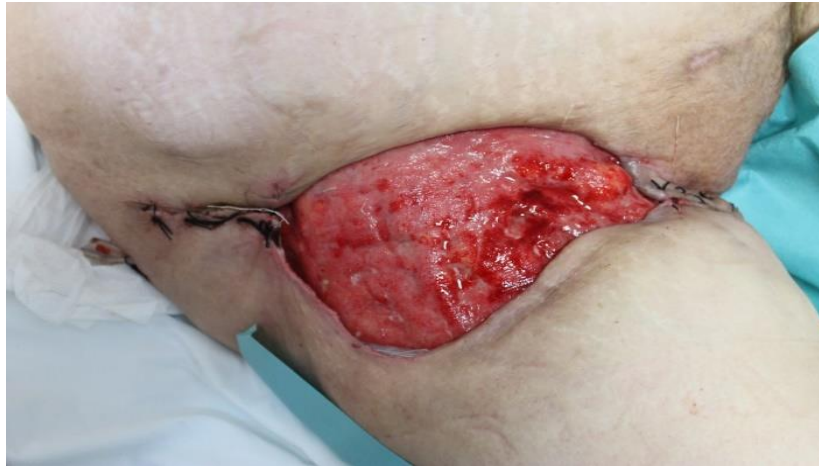
Figure 6: After about a month, granulation tissue formation.