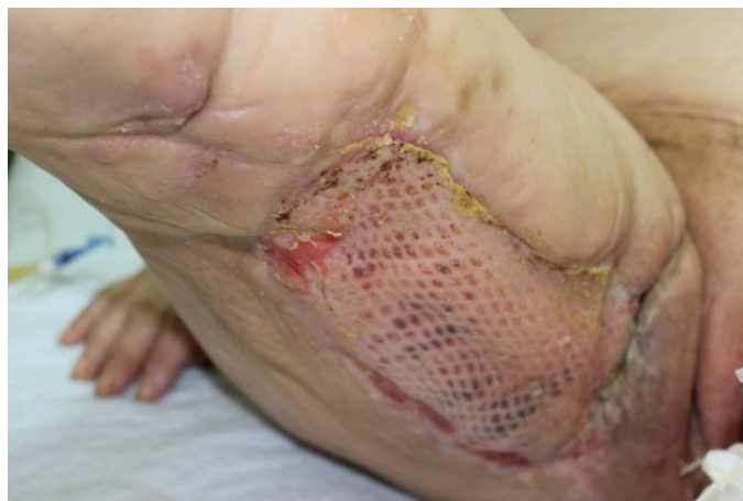
Figure 11: area skin graft after seven days.

and after ten days, the skin donor site was healed (figure. 12).