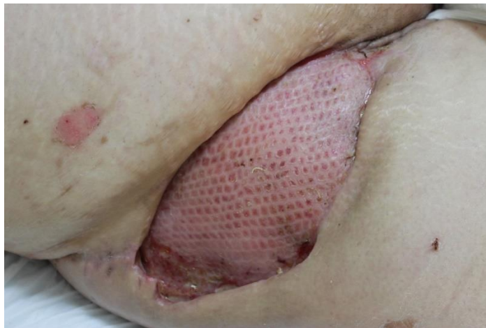
Figure 10: area skin graft after seven days.

After seven days, the skin graft area was healed (figure.10-11)