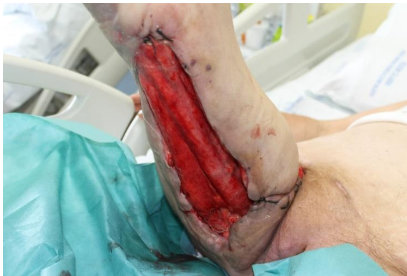
Figure 7: After about a month, granulation tissue formation.

It was then underwent to surgery of wound reconstruction, by partial-thickness skin graft (fig.8-9).