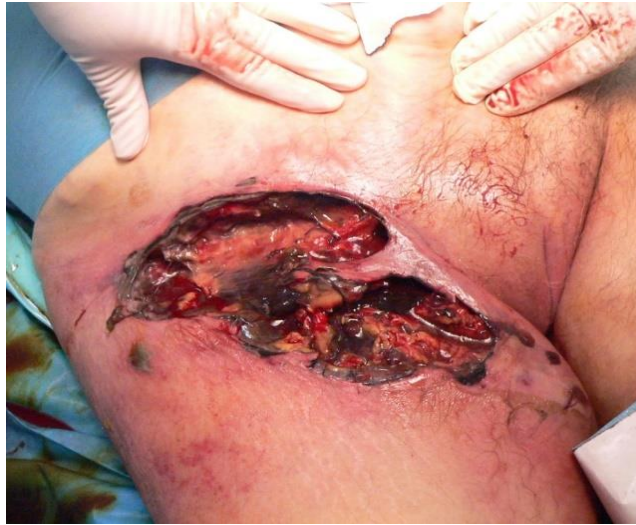
Figure 3: debridement until the appearance of vital tissue

Every day it was carried debridement until the gradual achievement of the fascia (two weeks after admission) (figure.4).