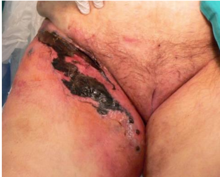
Figure 1: necrotic area smelling of the right inguinal-femoral region.

A 59-years-old woman was got into observation in a very serious condition, stupor with fever and extensive necrotic area smelling of the right inguinal-femoral region in extension to the thigh (fig. 1). No history of disease. Obesity. Heart rate being 105 bpm, respiratory F of 25 acts /minute and AP of 80/60 mmHg.