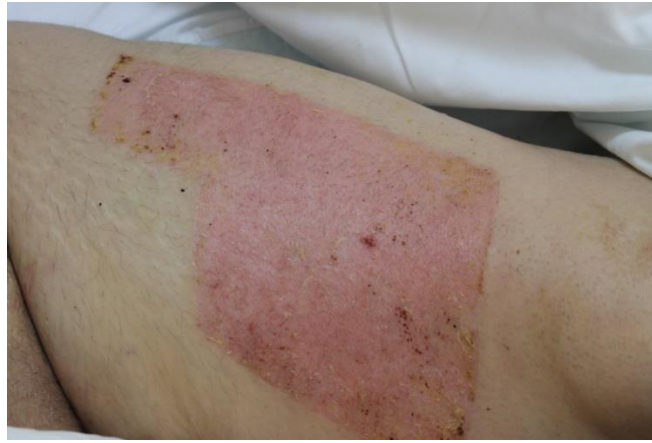
Figure 12: skin donor site after ten days.