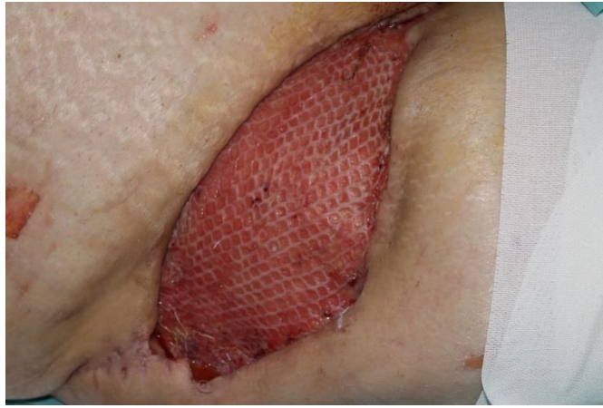
Figure 9: partial-thickness skin graft.

After seven days, the skin graft area was healed (figure.10-11)