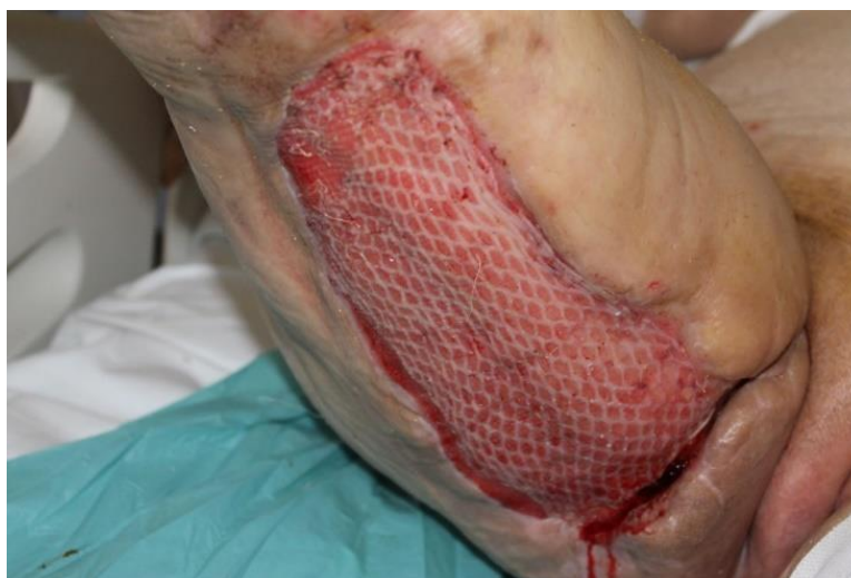
Figure 8: partial-thickness skin graft.

It was then underwent to surgery of wound reconstruction, by partial-thickness skin graft (fig.8-9).