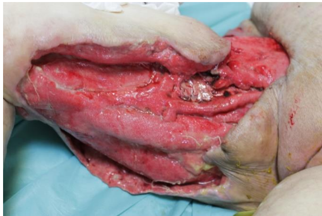
Figure 5: After about a month, granulation tissue formation.

Gradually, the general conditions have improved. Given a good toilet of the wound, he began, after about two weeks of admission, treatment with hyperbaric oxygen therapy for eight cycles. After about a month, the wound was clean with granulation tissue formation (figure. 5).