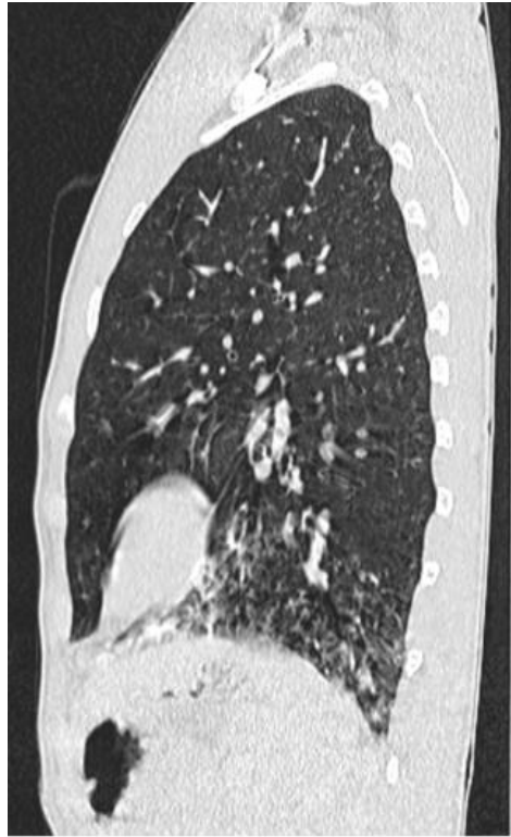
Figure 2: Computed tomography: signet ring sign (bronchiectasis)

The association of diffuse xanthonychia and chronic respiratory manifestations is suggestive of yellow nail syndrome (YNS). The chest X-ray shows a tram-track sign, and computed tomography reveals a signet ring sign (figure 2), confirming the diagnosis of bronchiectasis.