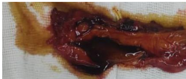
Figure 2: Perforated gall bladder