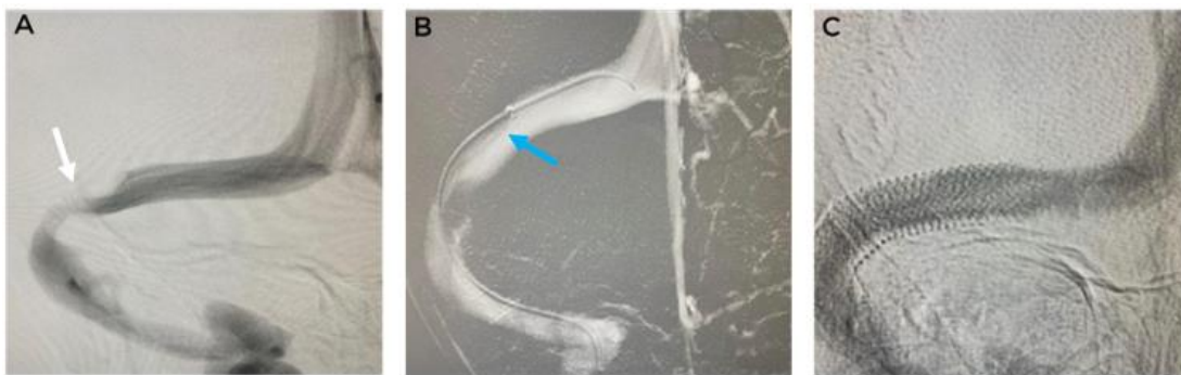
Figure 2. Pre- and post-procedure images of venous sinus angioplasty with placement of 1 carotid stent (PRECISE). Post-angioplasty manometry with a gradient of 0 mm Hg. (A) Venous phase angiogram, anteroposterior (AP) view, showing stenosis of the right transverse-sigmoid segment. (B) Navigation of the support system distal to the site of stenosis for subsequent stent deployment. (C) Final result after stent implantation, AP view.

Case 2: Young patient diagnosed with IIH with progressive visual loss, with angiographic diagnosis of dural venous sinus stenosis at the right transverse-sigmoid sinus junction and venous manometry showing a gradient of 10 mm Hg (Figure 2).