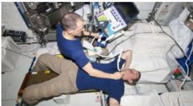
High Radiation in Microgravity