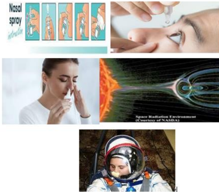
Single bubble in the syringe can spoil the Eye