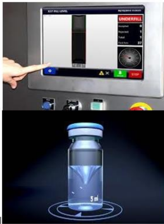
Particle inspection in liquid product