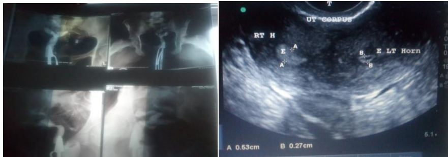
Figure 1 & 2; Pre-operative HSG and Pre-operative transvaginal sonography respectively.

Ante-natal was uneventful except for heightened anxiety during the first trimester and third trimester. She had a male neonate following an elective caesarean section at 39 weeks.