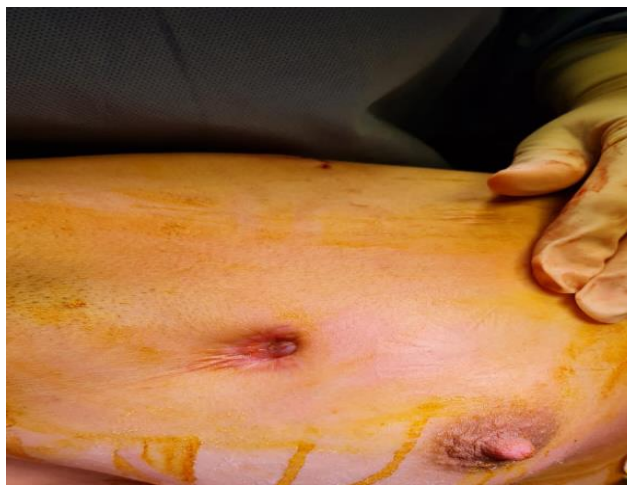
Figure 3: Axillary fistula.

Physical examination noted the presence of a left axillary fistula (Figure 3) with pus discharge.