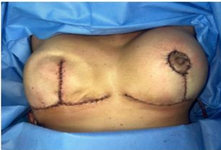
Figure 5. Result of the immediate right breast reconstruction through the latissimus dorsi muscle flap with breast implants and superior pedicle Mastopexy contralateral simetrization.