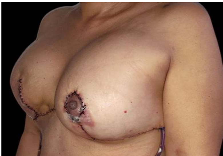
Figure 6: Result of the immediate right breast reconstruction through the latissimus dorsi muscle flap with breast implants and superior pedicle Mastopexy contralateral simetrization.