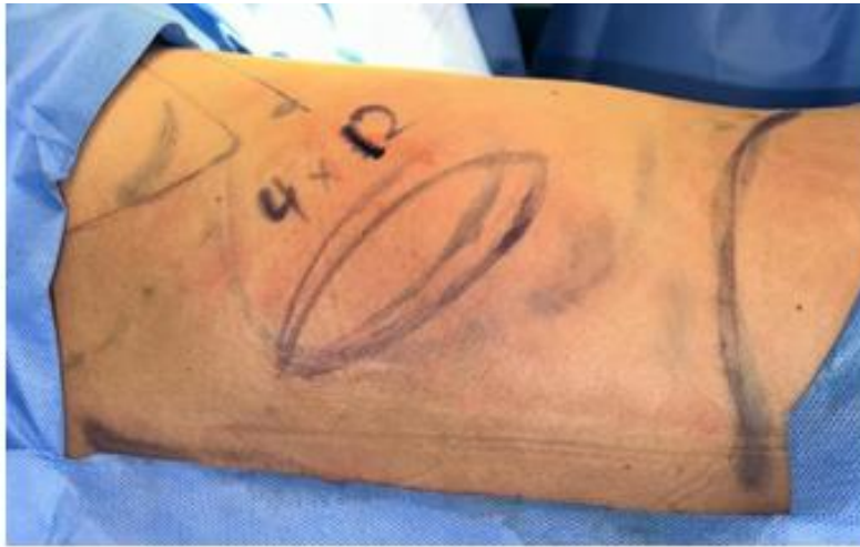
Figure 3. New LDMF design with the patient in left lateral position at the operation room.