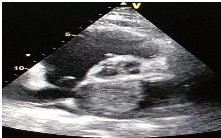
Figure 1: ETT left parasternal long axis showing a large hyperechogenic mass in the left atrium.

Transthoracic echocardiography (Figure 1) showed a dilated left atrium with a hyperechogenic mass measuring 31/28 mm transversely and 69/37 mm longitudinally, appended to the AIS, obstructive at times with a mean gradient over the mitral valve of 14 mmhg. LVOT was 60% and PAPS 76 mmhg.