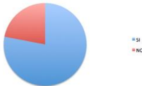
Figure 10: 100% answered affirmatively to the 9th question of the questionnaire.

Regarding the comments obtained, the population described that they knew the term artificial intelligence, but the vast majority do not recognize its definition as such. A large percentage believes that they have used tools related to it, but given that not all the population handles the term it well, it is possible to bias this question. Regarding the question related to the ethics of its use, many demonstrated knowledge argued with scientific articles available on multiple bibliographic platforms. The knowledge of surgical simulators was amply demonstrated with solid arguments, as well as the answers regarding safety and learning technique.