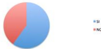
Figure 3: 60% answered affirmatively to the 2nd question of the questionnaire.

HA UTILIZADO EN LOS ÚLTIMOS AÑOS ALGUNA HERRAMIENTA VINCULADA A LA IA?