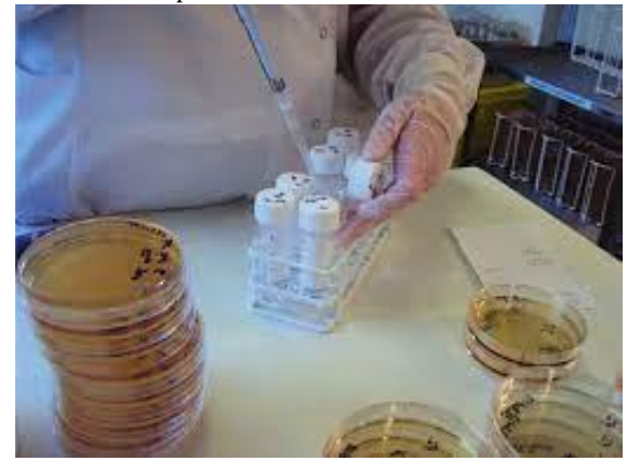
Figure 1.2: Analyst performing bioburden experiment.

For non-sterile products, the specification usually sets a maximum permissible microbial count, and the fruit is necessarily expected free from particular unpleasant microorganisms. In cases including non-clean products, the microbiologist needs to expect complications in authenticating these qualifications, which usually believe primary experiment and the nature of the fruit. At this stage, some necessities for preservative productiveness to prevent microbial adulteration of the produce are still deliberate.