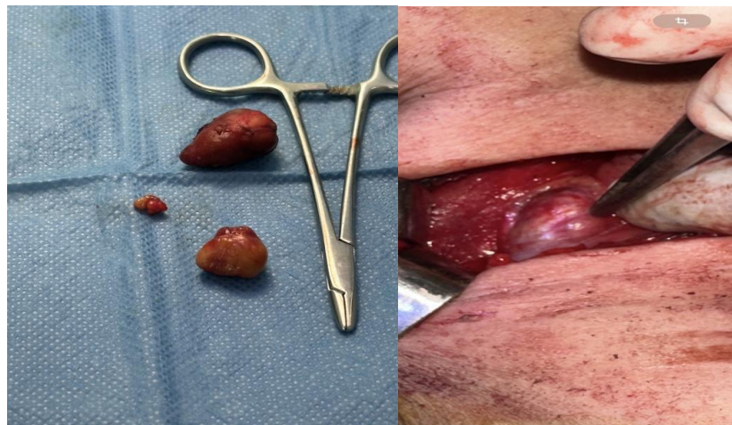
Figure 3.4: Peroperative image of the parathyroid mass on the left, the image of the two removed parathyroid formations