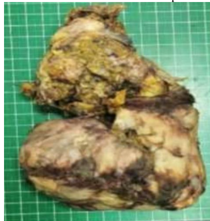
Figure 3: Macroscopic image of resected mature teratoma, dimensions 17 x 10 x 6 cm.

Histologically, the presence of multiple mature-looking tissues is detected, including mesenchymal tissue such as striated muscle and cartilage, as well as bone marrow, squamous epithelial tissue, with cutaneous adnexa, adipose and mucoproducing tissue. (Figures 3 and 4).