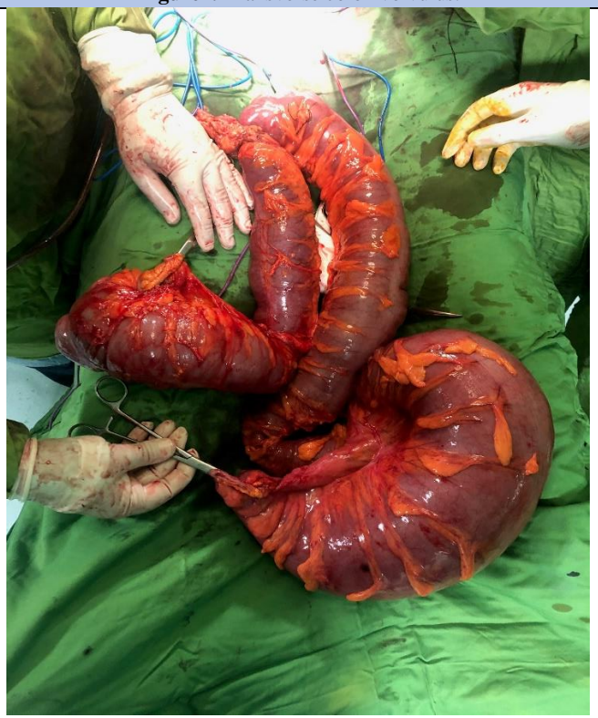
Figure 3: Total colectomy.