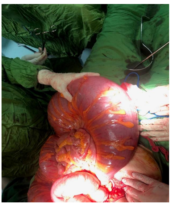
Figure1: cecal and transverse colon volvulus.

Our case was a 52 years old female with history of recurrent and transient abdomibal distention for 10 days in every months. She referred to Surgery parts and we start examinations and lab data's. She has 6200/ml WBC, no fever, no nausea and no vomiting. She has good and healthy appearance and in abdominal examination she has distention synchronized in abdomen, no scar of surgery, no colorless and no tenderness. We perform a triple CT for her and we find 2 Simultaneous separated in cecal and transverse colon volvulus that in surgey we find them (figure1), with this information we programing a surgery for her. In Laparatomy we find transverse colon volvulus (figure 2) and we decide to do total colectomy (Figure 3). It shows she has 3 years Chronic Simultaneous separated triple large bowel volvulus (Figure3).