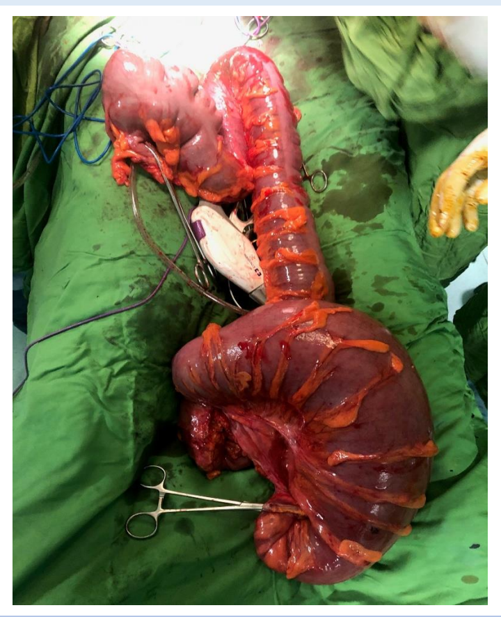
Figure2: Transverse colon volvulus.