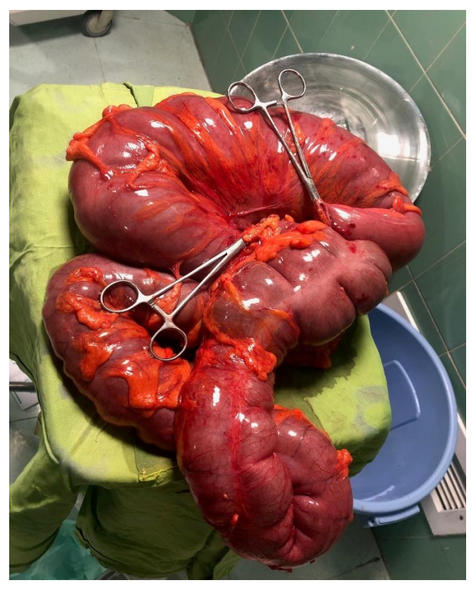
Figure4: Simultaneous separated triple large bowel volvulus.