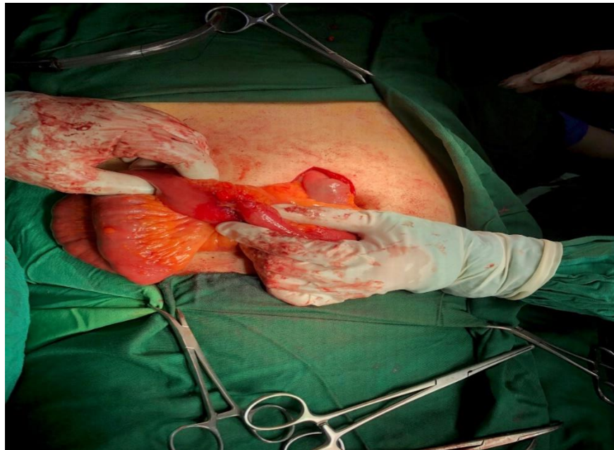
Figure 2: complicated Meckel's diverticulum (MD).