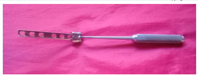
Figure 2. Own sheet holder, designed by our service team.