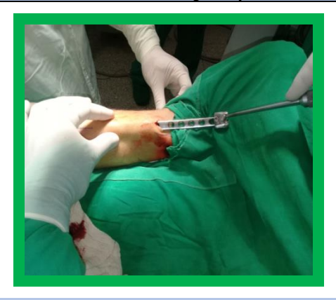
Figure 3. Use of the blade holder in tibia fracture surgery.