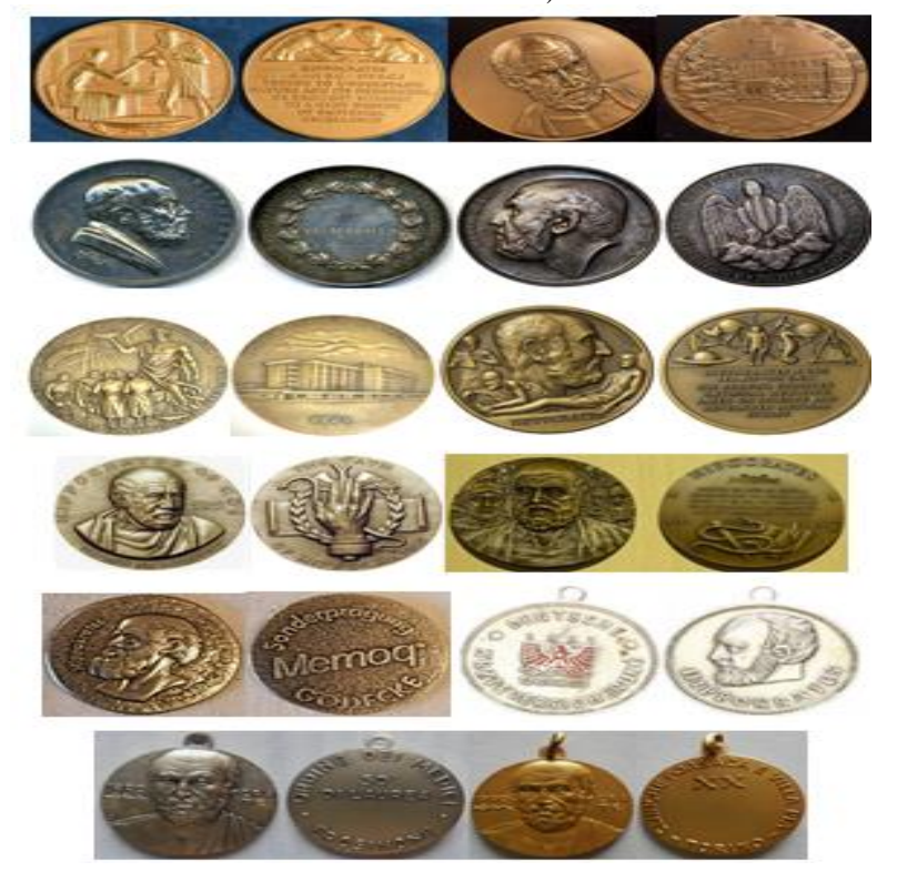
Figure 5. Commemorative medals dedicated to Hippocrates

years of their issue [29-75]. Presented are both traditional, round, commemorative table medals, and plaques - rectangular, commemorative medals dedicated to Hippocrates - Figure 5. Most of the presented examples, screenshot copies of commemorative, table medals, as well as two award, phaleristic medals, are presented both in the obverse (front, front part of the medals)