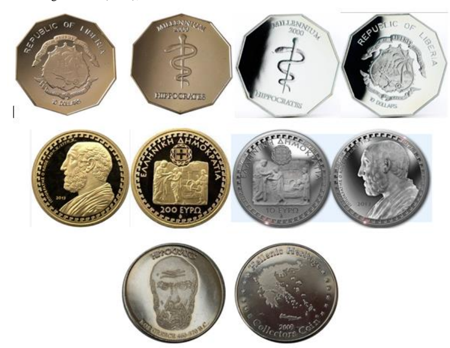
Figure 6. Commemorative coins dedicated to Hippocrates

of 10 and 200 euros; a coin of the Republic of Liberia (2000), with a face value of 10 local dollars; a coin of Italy [62-66].