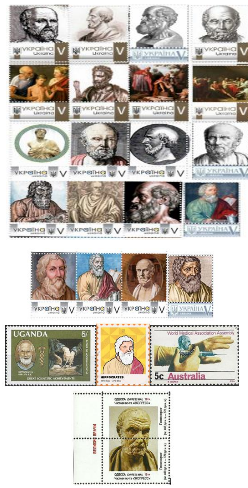
Figure 1. Postage stamps of the world dedicated to Hippocrates

Further, in thematic figure 2, a small selection of postal blocks (8 copies of their screenshot copies) dedicated to Hippocrates is presented, from such countries of the world as the Central African Republic, Moldova, Ukraine (4 copies of their screenshot copies), the Yemen Arab Republic [11, 18, 77].