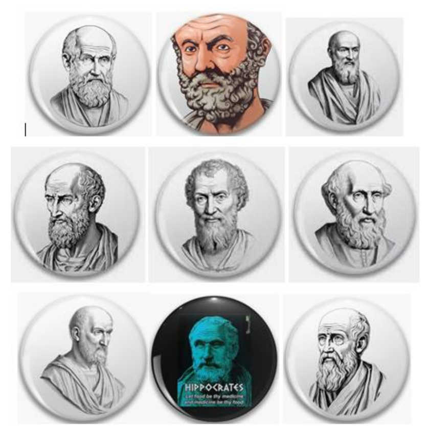
Figure 7. Hippocrates in the reflection of phaleristics, on thematic commemorative badges

Further, in conclusion of this article, in Figure 7, a small phaleristic collection is presented, consisting of 9 commemorative badges, thematically dedicated to Hippocrates [81].