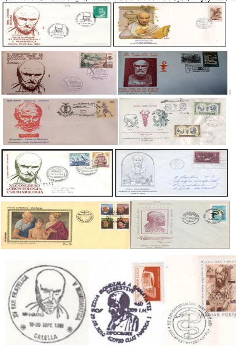
Figure 3. Postal envelopes and special cancellation postmarks dedicated to Hippocrates

Figure 3 shows a small selection of artistic stamped envelopes (10 copies) and thematic postmarks, special cancellation (3 copies), thematically dedicated to the genius of Hippocrates, in a total of 10 screenshot copies, from such countries of the world as Spain, Hungary [16, 19-25, 80].