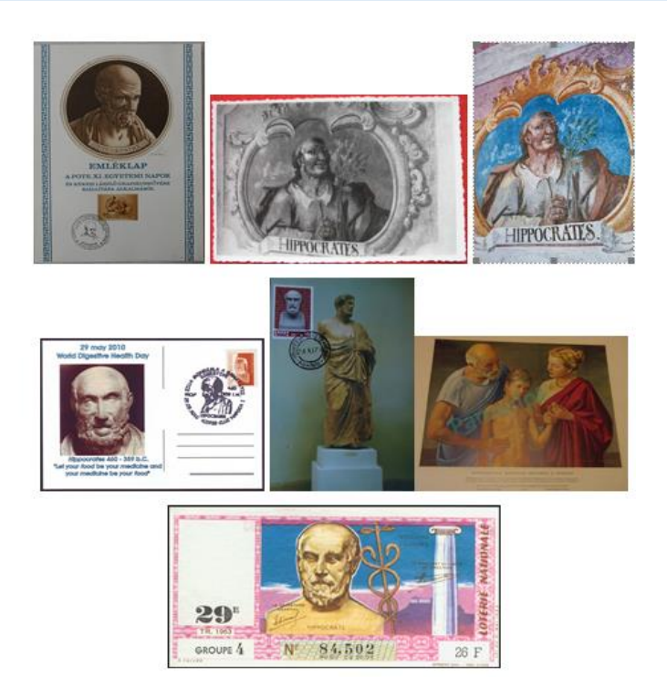
Figure 4. Collection of collection materials dedicated to Hippocrates

Figure 5 shows the largest, thematic, numismatic collection of screenshot copies of commemorative medals made of different metals (bronze, silver, gold and various alloys) and dedicated to the historical memory of Hippocrates, in total - 49 commemorative medals and 5 commemorative coins, from different countries of the world, topics and events, as well as