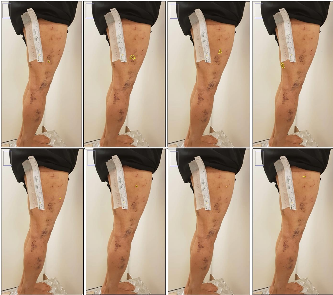
Figure 2: Example – calculation of bruise areas on the right lateral side using ImageJ® software.

In addition, the bruised areas were classified by the blinded physician according to the severity of the total area involvement and subsequently analyzed according to the following scale.