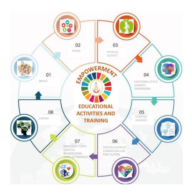
Figure 2: Intervention Scheme.

Figure 1. Intervention Development and Distribution Over Time. Self-made illustration