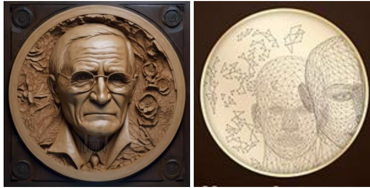
Figure 6. Numismatic materials dedicated to Carl Gustav Jung

This concludes the first of a series of original articles about the reflection of psychology, and its famous scientists, in the means of phaleristics, numismatics and philately, on thematic icons. A number of new articles are being prepared for release about famous psychologists, about thematic icons, in particular about Lev Vygotsky, Alfred Adler and other famous world psychologists, which will be published by the author in the near future.