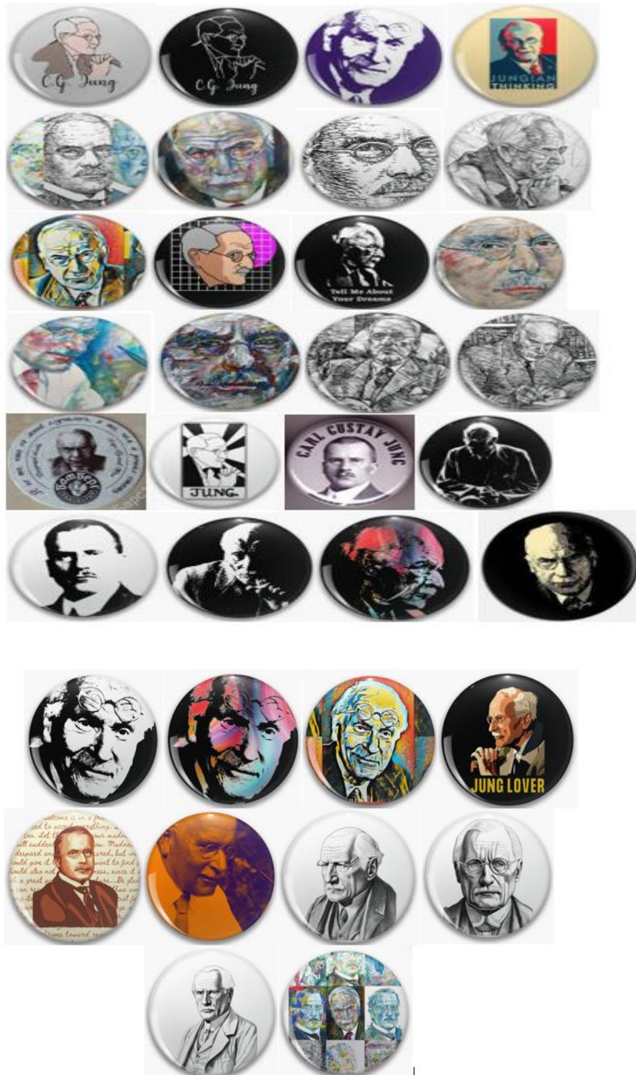
Figure 1. Portraits of Carl Gustav Jung in a selection of thematic badge

In Figure 2, a small selection of phaleristic materials is presented, in the form of 39 screenshot copies of thematic badges, bearing on their front part/obverse, quotes from the scientist, both with and without his portrait, independently [1, 2, 6-8, 10].