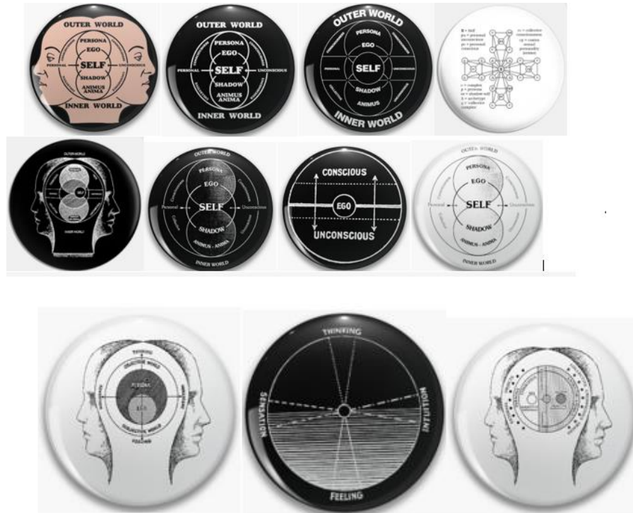
Figure 4. Psychological views and theories of C.G. Jung in a selection of thematic badges

The following thematic, philatelic selection, in Figure 5, dedicated to Monaco and Switzerland, 1 postal envelope, as well as 4 postal blocks - philately, presents postage stamps from the states of Grenada, Ukraine, Spain and Ukraine, and 6 postcards dedicated to C.G. Jung [3-5, 9].