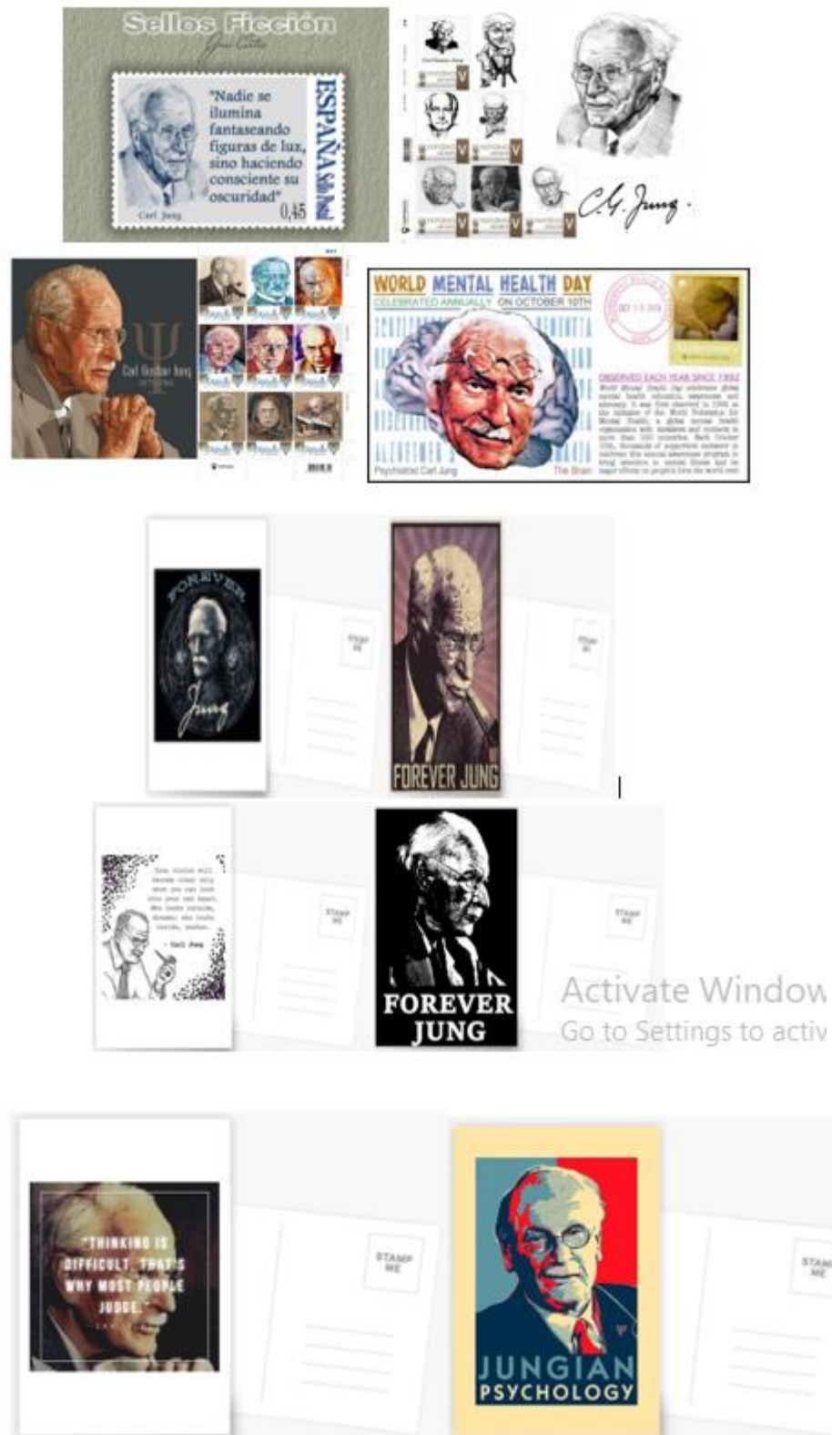
Figure 5. Philatelic materials dedicated to Carl Gustav Jung

Figure 6 shows the obverse and reverse of the commemorative medal dedicated to Carl Gustav Jung [1].