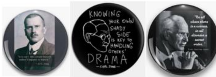
Figure 2. Carl Gustav Jung quotes from the scientist, both with and without his portrait, independently in a selection of thematic badges

Carl Gustav Jung, like his great colleague, Sigmund Freud, was a heavy smoker but, unlike Freud, he smoked a pipe, not cigars, like Sigmund Freud. Most of the world-famous psychologists also smoked a lot. In many of his portraits and photographs, Carl Gustav Jung was depicted smoking, with his