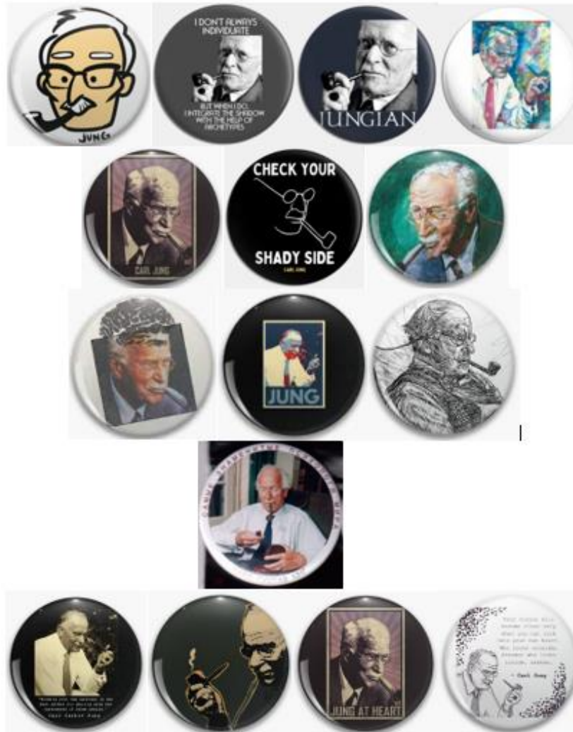
Figure 3. A selection of themed badges, depicting Carl Gustav Jung holding his pipe

pipe in his hand. Figure 4 shows an original selection of 15 thematic screenshots of badges depicting Carl Gustav Jung with his pipe in his hands [1, 2, 6-8, 10].