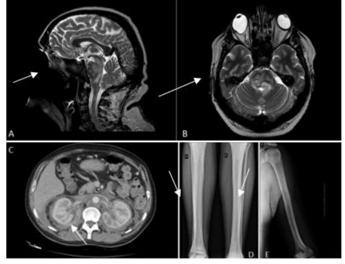
Figure 2: A) A contrast-enhanced magnetic resonance image (MRI) of the head obtained prior to presentation is shown (sagittal, T2-weighted). Arrow: multiple hyperintense focal lesions affecting the brainstem. B) A contrast-enhanced head MRI obtained prior to presentation is shown (axial, T2-weighted). Arrow: multiple hyperintense focal lesions affecting the brainstem. C) A contrast-enhanced abdominal computed tomography image is shown. Arrow: extensive retroperitoneal lesion. D) Radiography of the lower limbs is shown. Arrow: sclerotic lesions compromising the bone marrow symmetrical-looking cortical thickening. E) Radiography of the left arm is shown. Arrow: sclerotic lesions compromising the bone marrow symmetrical-looking cortical thickening.

Contrast-enhanced computed tomography (CT) of the chest revealed material with the density of soft tissue involving the aortic branches, consistent with ECD. A discrete pulmonary interstitial component and pericardial effusion were also noted. Abdominal CT with contrast demonstrated an extensive retroperitoneal lesion encompassing the kidneys, adrenal glands, aorta, and vena cava (Figure 2), which are also compatible with ECD.