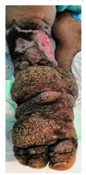
Figure 3: incisional skin biopsy of the right leg

An incisional skin biopsy (figure 3) from lesion showed acanthosis and hyperkeratosis of the epidermis, associated with dermal hypertrophy with mild perivascular lymphocytic exudate concentrated around ectatic lymphatics (Figure 4,5).