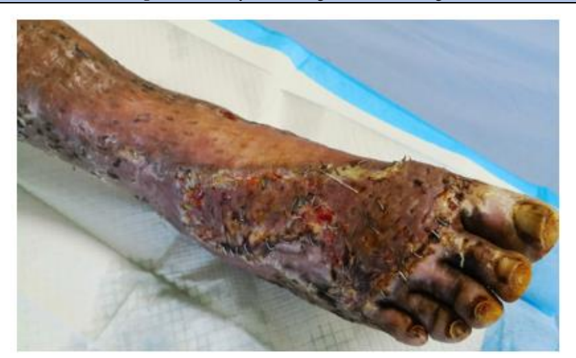
Figure 9: 1 month post skin graft

Figure 10: months post skin graft, remission of the total skin treated by integra while there was a recurrence between the toes of the right foot not covered by this procedure