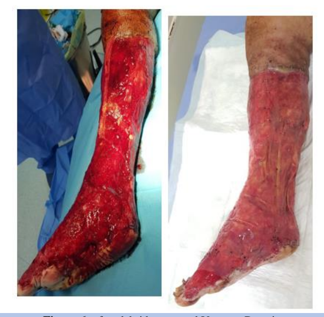
Figure 6: after debridement and Vacuum Dressing Figure 7: Application of Integra

of the foot including spaces between toes, were removed until the aponeurosis of the muscle. These procedures were followed by the application of a vaccum dressing to be changed every 5 days (figure 6).