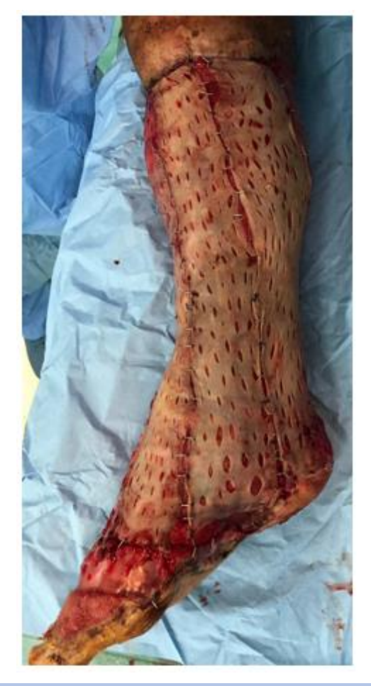
Figure 8: directly after skin graft from the Thigh

Eight months later, we observed a remission of the total skin treated by integra while there was a recurrence between the toes of the right foot not covered by this procedure (figure 10).