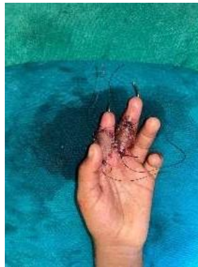
Figure 2: Post Burn Contracture Release and Full Thickness Skin Graft done