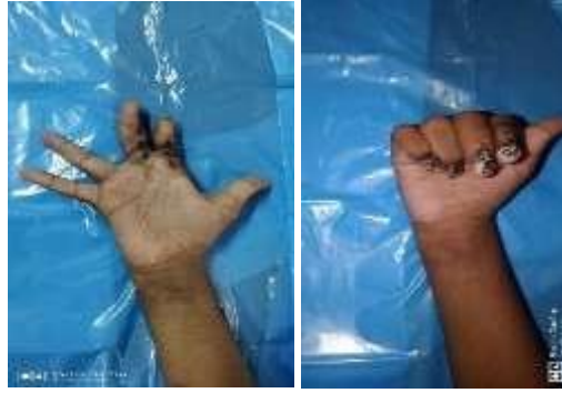
Figure 4: At discharge with well healed Full Thickness Skin Graft

Previous study conducted by Puttirutvong [7] has evaluated the healing time of both meshed full-thickness skin grafts versus STSGs (i.e., 0.015-in thickness) in patients with diabetes. This study revealed a mean total healing time of 20.1 \pm 7.3 days for the STSG group, with the primary factor affecting graft take being hematoma/seroma formation and infection. Vijayaraghavan et al [8] showed that wounds treated with APRP therapy alone healed in 4–8 weeks. Wounds treated with APRP, and split skin graft/flap cover healed in 3–6 weeks.