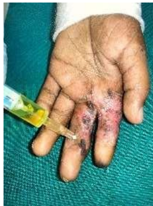
Figure 3: Autologous Platelet Rich Plasma