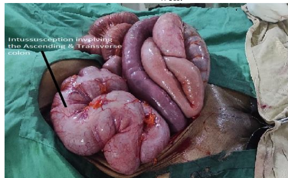
Figure 1: Intussusception insitu.

The patient made an uneventful post-operative recovery and was discharged home on the 8th day after surgery. He’s been followed up at the outpatient surgery clinic for 6-months and has remained clinically well.