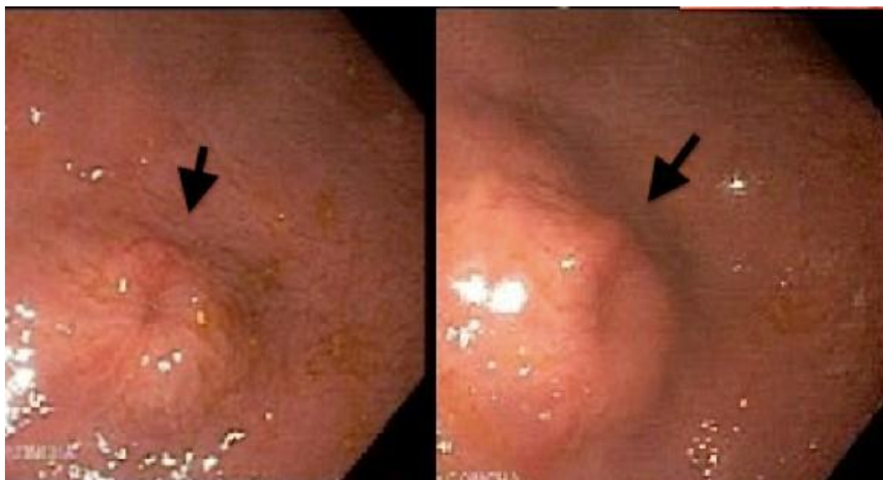
Figure 1: Absent gastrostomy tube in the stomach.

Colocutaneous fistula was diagnosed and the patient underwent a laparotomy. At the time of surgery, no injuries or signs of previous connection with the stomach were seen and PEG was located into the transverse colon. Figure 2. The colocutaneous fistula was excised, the colonic hole was closed, and a regular open gastrostomy performed without any complications. Figure 3. The patient was discharged 5 days after the procedure with an uneventful postoperative course.