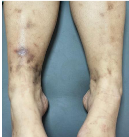
Figure 3: Hyperchromic macules and residual post inflammatory scars.