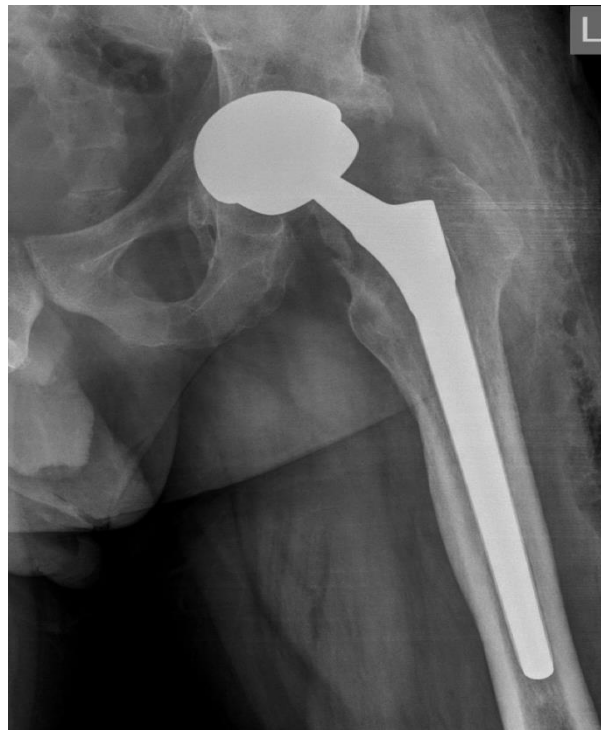
Figure 3: Postoperative radiograph of the left hip.

The presented surgical tactics reduced the operation time, blood loss and bone loss, but requires observation.