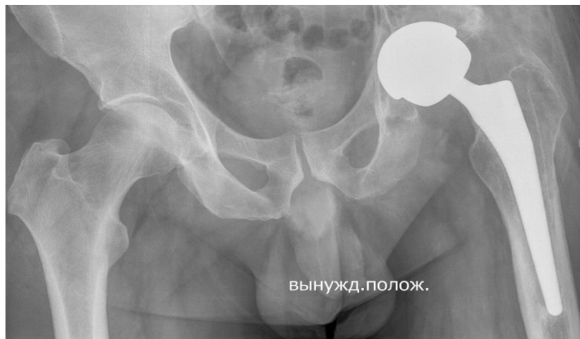
Figure 2: Plain radiograph of the pelvis before surgery.

Two years after the injury total hip arthroplasty was performed using a metal-on-metal friction pair (Duron, Avenir, Zimmer (Figure 2).