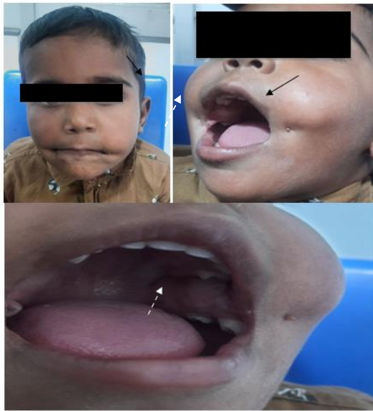
Figure (1a-c): Photograph of the child showing protuberances in to both cheek regions since birth, left more than right (black arrows). An open-mouth view shows supernumerary teeth in relation to the maxilla (dotted arrow).

An AP and lateral view of the X-ray face revealed two bony maxillary outgrowths on either side [Figure 2a-d].