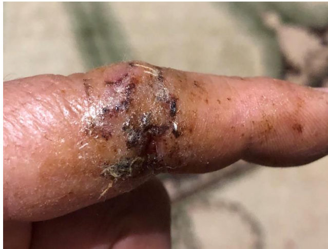
Figure 5 .1. September 29 2020(seventh day).