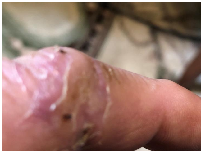
Figure 7.2. October 9, 2020(seventeenth day).