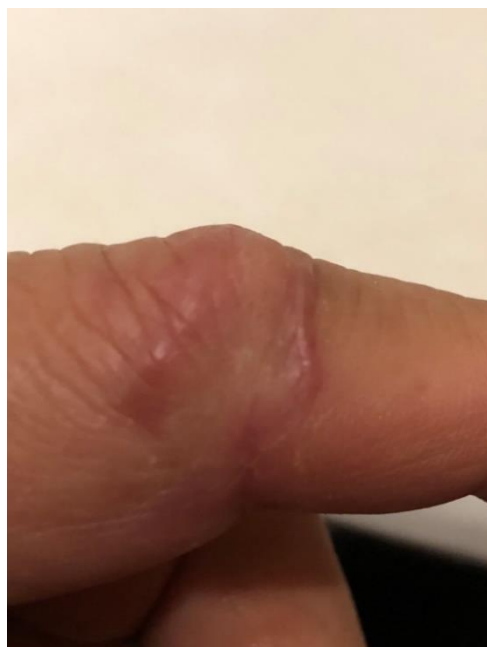
Figure 8 .1. October 21, 2020(a month later).