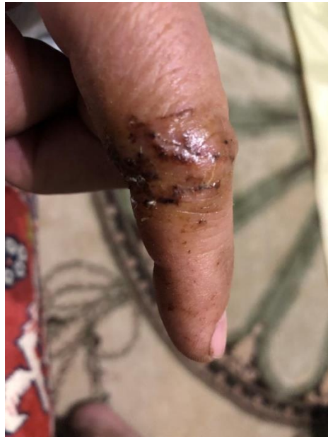
Figure 6 .2. September 30 2020(eighth day).