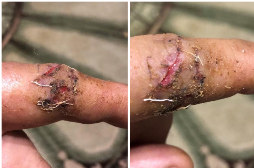
Figure 3 .1. September 27, 2020(fifth day).