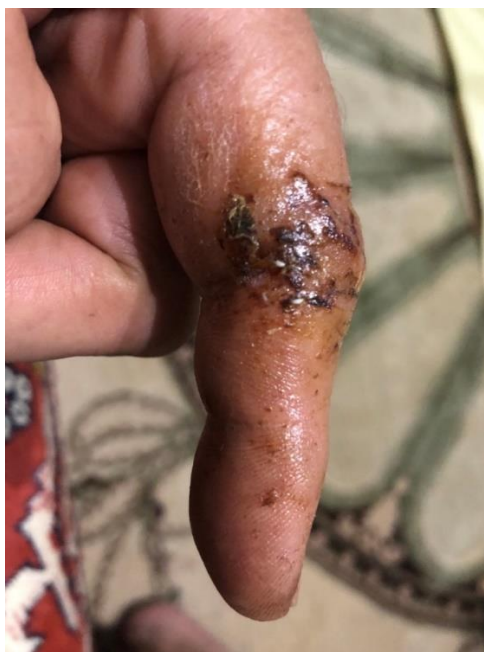
Figure 6 .1. September 30 2020(eighth day).