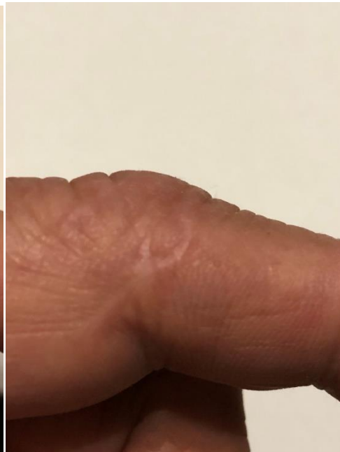
Figure 9 .1. October 21 ,2023(in 3 years).