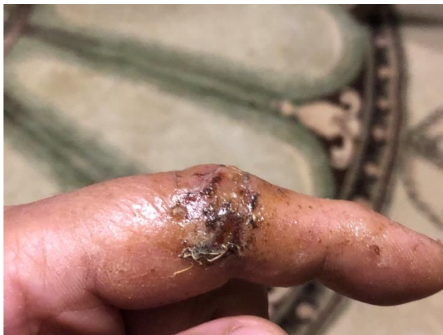
Figure 4 .1 . September 28 2020 (sixth day)