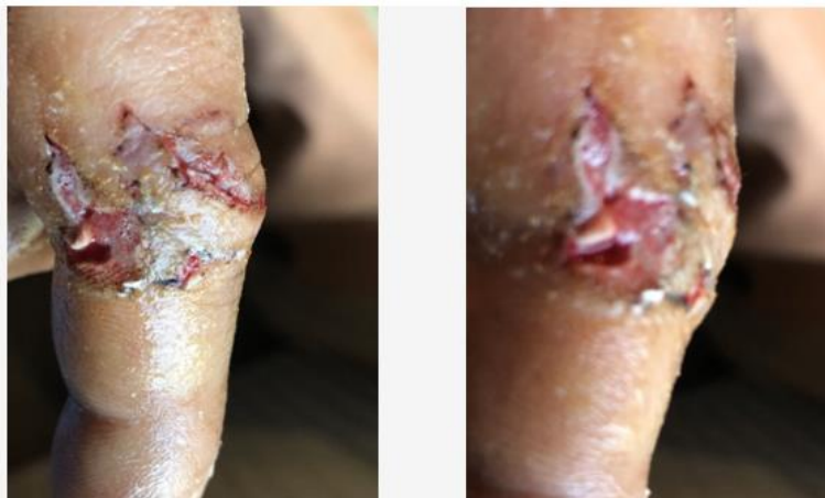
Figure 1.1. September 23, 2020(the third day).