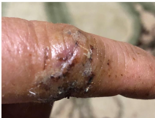
Figure 5 .2. September 29 2020(seventh day).