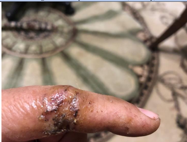
Figure 4.2. September 28 2020 (sixth day).