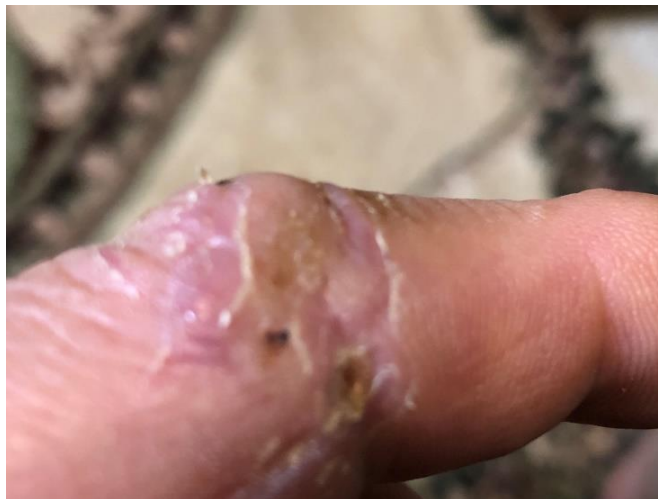
Figure 7. 1. October 9, 2020(seventeenth day).