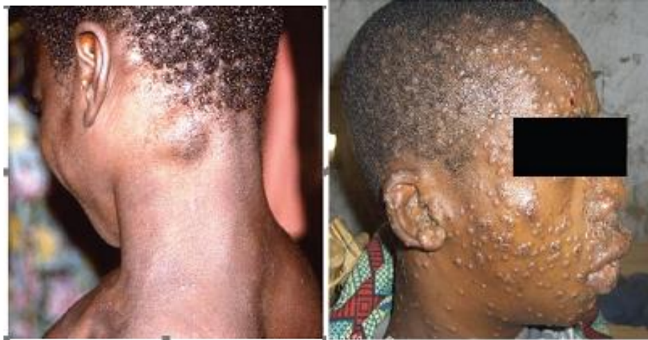
Figure 1: Cervical Lymphadenopathy in a Patient with Active Monkeypox