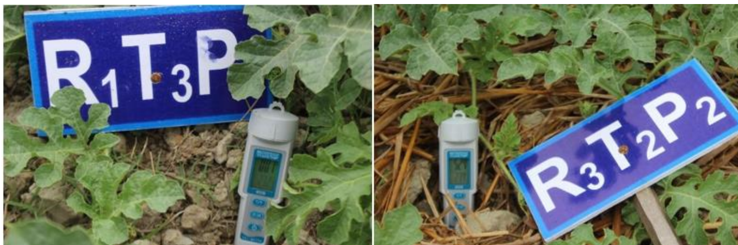
Figure 1: Taking moisture data from experimental plot.