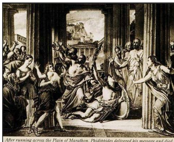
After running across the Plain of Marathon, Pheidippides delivered his message and died.

Humans have been partaking in long-distance running for thousands of years. In fact, the word ‘marathon’ has its roots in Greek history, where following a battle in 430 BC in a town known for its marathon – the Greek word for fennel – a messenger named Pheidippides ran 260 kilometers to inform the authorities of their victory. After relaying the message, he collapsed and died of what is suspected to be a cardiac arrest