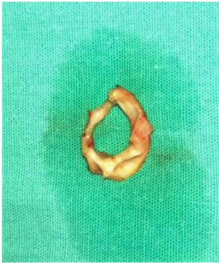
Figure 2: Surgical treatment: macroscopic view of aortic subvalvular ridge following surgical resection.