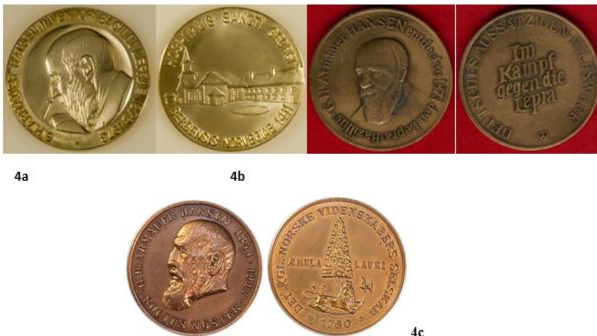
Figure 4a-c. Commemorative medals issued in honor of Gerhard Hansen

The reverse of the medal features the small seal of the Royal Norwegian Scientific Society [12,13].