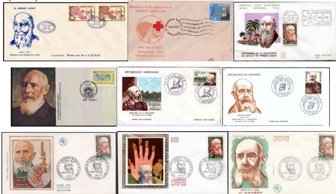
Figure 2: Envelopes dedicated to Gerhard Hansen

of Dahomey, France, mainly for the 100th anniversary of the discovery of the causative agent of leprosy (leprosy), are presented in Figure 2 [5,6,7,8].