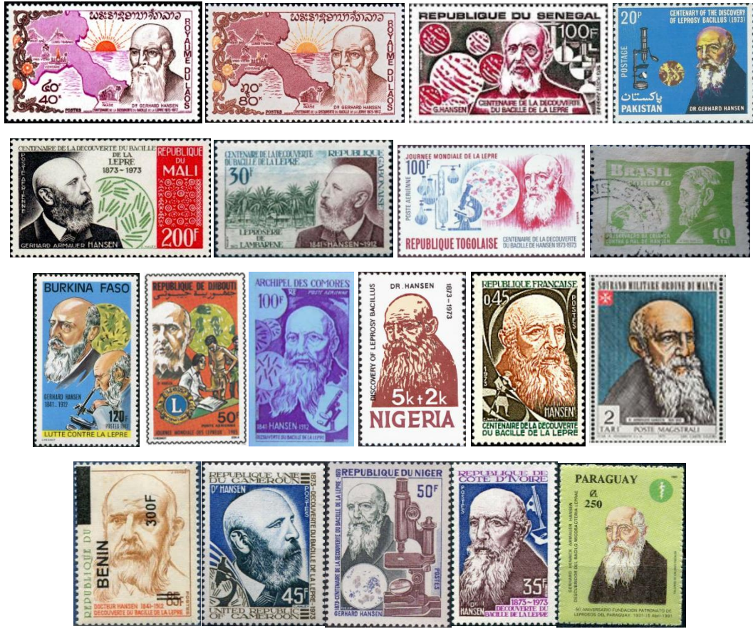
Figure 1: Gerhard Hansen on world postage stamps

There are also a number of first-day postal envelopes, postage stamps, images and special cancellation seals dedicated to the Norwegian scientist who dedicated his life to the fight against leprosy. Some of these envelopes, issued by the postal departments of Laos, India, the Republic