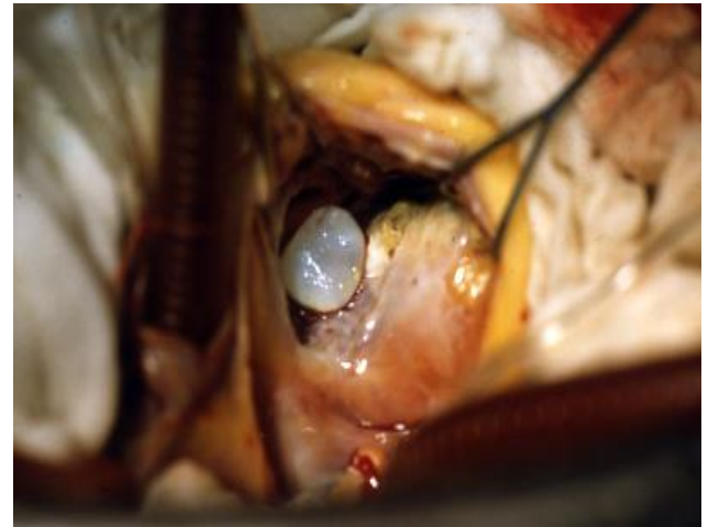
Cyst of interventricular septum

All patients underwent an extension assessment to look for other locations, in particular an abdominal ultrasound. An abdominal CT angiogram was performed in one patient because the abdominal ultrasound was not informative.