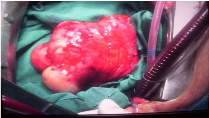
Left ventricular lateral wall cyst

The diagnosis of hydatid cyst is difficult because the clinical symptoms are non-specific and highly variable. [9]. Claque signs appear either when there is a complication: ruptured septal cyst in the pulmonary artery [2,10], or rhythm or conduction disturbances as in our series, or