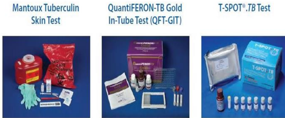
Figure 1: Test for M. tuberculosis Infection.

The skin test involves injecting a small amount of fluid (called tuberculin) into the skin in the lower part of the arm. Then the person must return after 48 to 72 hours to have a trained health care worker look at their arm. The health care worker will look for a raised hard area or swelling, and if there is one then they will measure its size. They will not include any general area of redness [9,10].