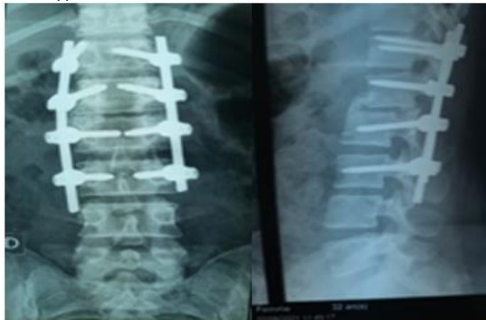
Figure 2: Postoperative images showing reduction and stabilisation with pedicle screws.

performed using two parallel rods attached to 8 pedicle screws, 4 on each side, placed at 4 levels (D12, L1, L2 and L3) under fluoroscopy. This stabilisation was preceded by contraction of two dislocated spinal ends (Figure 2). During the same procedure, the gluteal ulcers were debrided and sutured in two layers, first with number 2/0 vicryl and then with number 0 monofilament nylon.