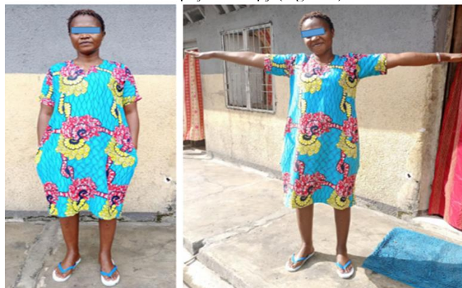
Figure 3: Patient regained power, standing station and walking.

Postoperatively the patient could regain power and could stand up at one week, followed by walking with a walking frame at three weeks and normal walking at two months after several sessions of rehabilitation and physiotherapy (Figure 3). She also recovered the vesico-sphincter function.