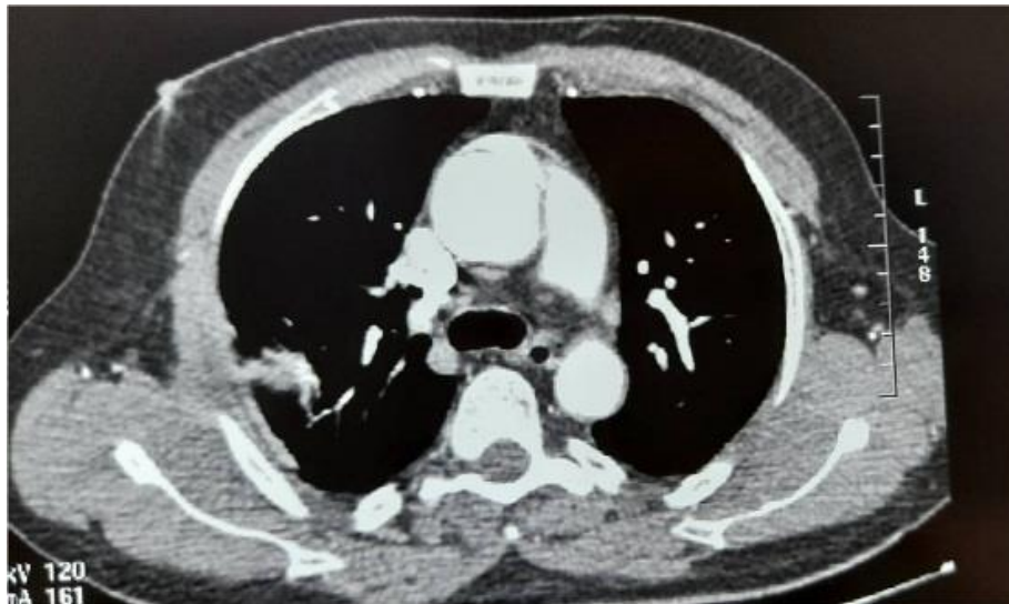
Figure 1: CT scan showing the dissection of the ascending aorta.

Emergent trans-thoracic echocardiography confirmed the localized dissection of the ascending aorta without pericardial effusion. The coronary dissection was treated by deploying 5 stents. Then, the patient underwent emergent surgery with cardiopulmonary bypass between arterial femoral cannula, and atrio-caval femoral cannula.