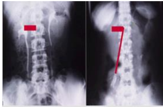
Figure 3: Shows renal pedicle mapped on a supine IVU film (Horizontal) and erect film (Vertical) limbs of 7 where the renal pedicle is stretched to 3 times its normal length, causing stenosis and ischemia.

The TBL is a fundamental law of nature that govern the ramifications of all trees of green and red of the Aorta-arterial trees. It corrects two important misconceptions on the capillary physiology. This evidence sums up to demonstrate that the capillary-ISF transfer occurs according to a precise fast circulation of the magnetic field like fluid not the slow perfusion. That provides adequately for the demands of cells at rest and increased demand during strenuous physical activity. On another subject, this article [12] reports the overlooked link of Loin Pain Haematuria Syndrome with Symptomatic Nephroptosis and the Results of a new curative surgery; Renal Sympathetic Denervation and Nephropexy Surgery. Two new signs namely; the IVU 7 sign (Figure 4) and tube stretch hypothesis were reported demonstrating that renal pedicle stretch causing vessel stenosis, ischaemia and neuropathy. Surgical treatment was used in 28 patients; 10 had simple nephropexy and 18 had Renal