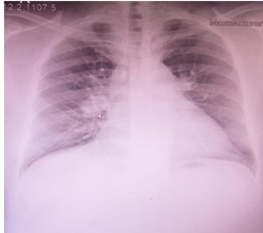
Figure 1. Chest X Ray: Image of inflammatory condensation at the level of the right ilium

It is interpreted as post-covid pneumonia and antibiotic treatment is indicated.