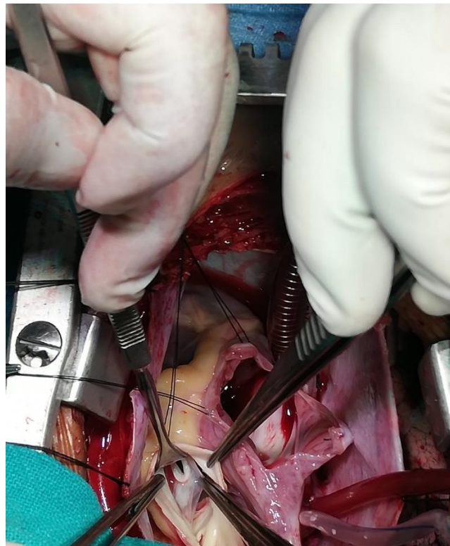
Figure 2: Perforation of Right Coronary Cusp